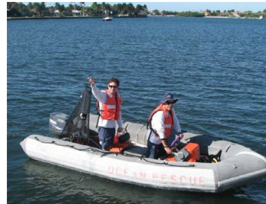
Palm Beach County

Keep Brevard Beautiful received a grant to maintain the Adopt a Road and Adopt A Shore teams by providing equipment maintenance and outreach materials ($15,000)