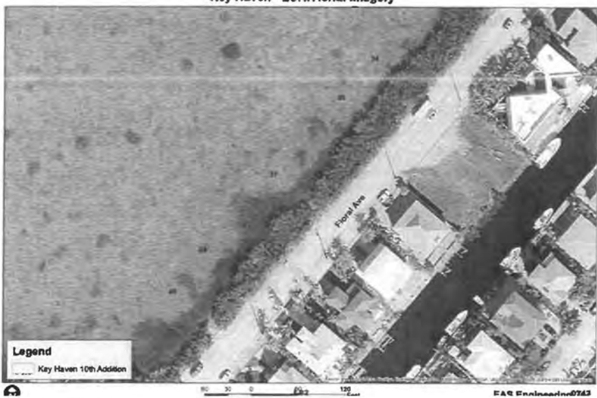
Joint Exhibit 82

3. DEP is the administrative agency of the state having the power and duty to protect Florida's air and water resources, and to administer and enforce the