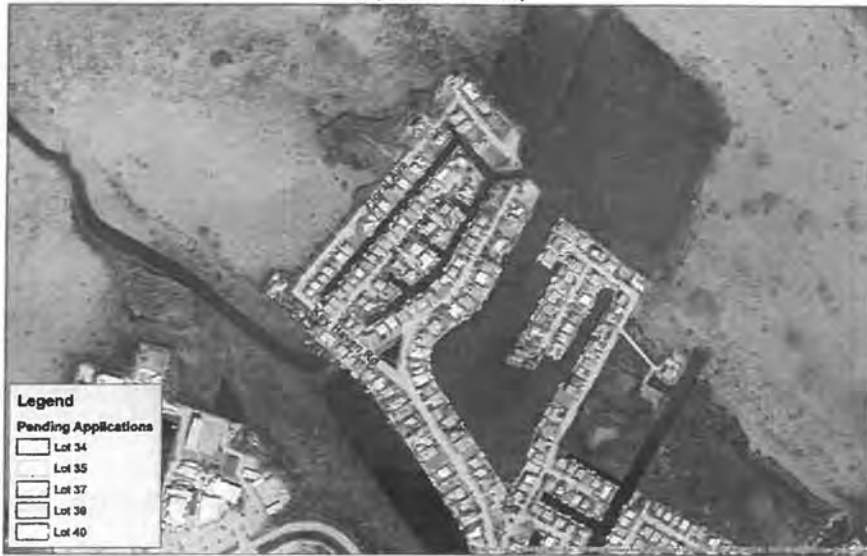
Joint Exhibit 81