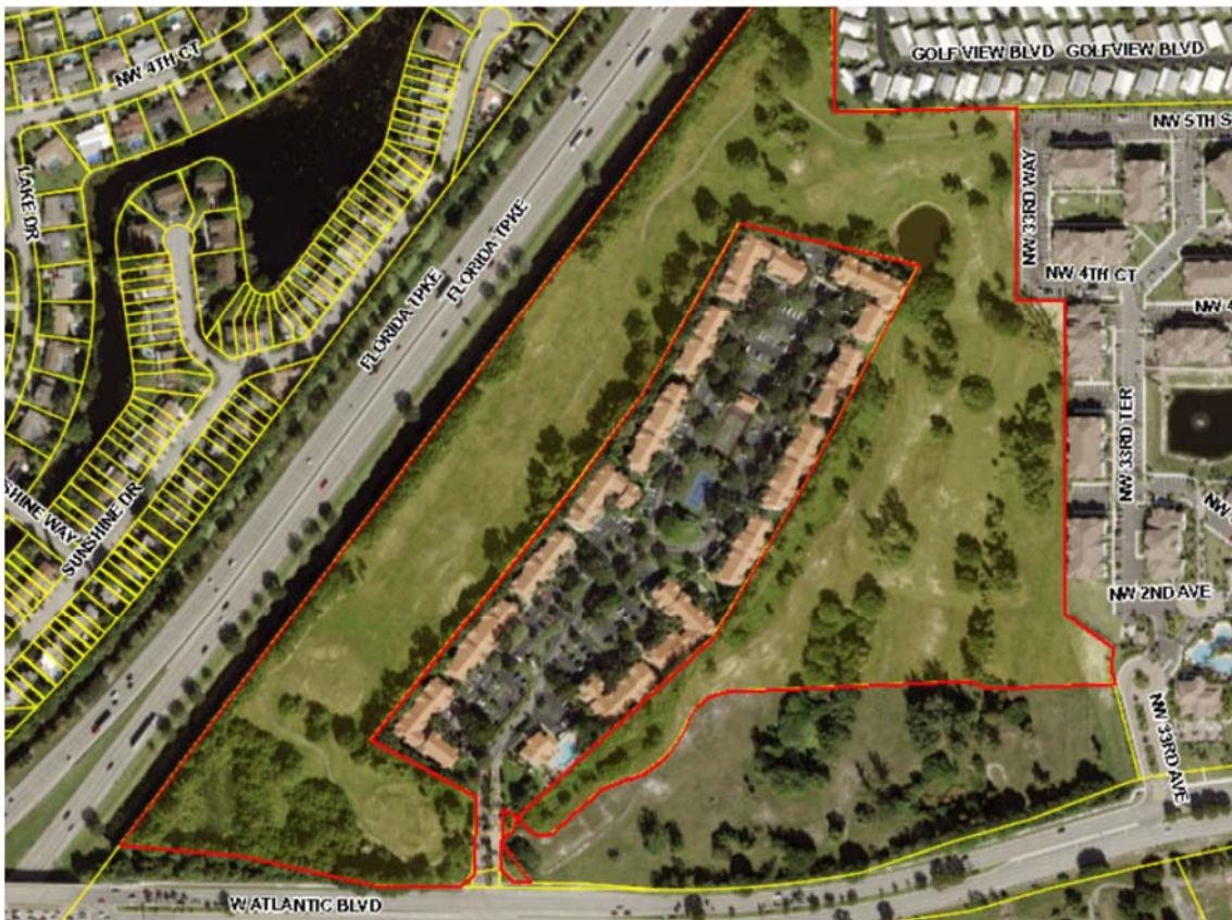
Aerial View of the Former Palm Aire Golf Course III Brownfield Site in Pompano Beach, outlined in red. The site adjoins the Former Palm Aire Golf Course Brownfield Site (BF061601001) to the south and the West Atlantic Blvd. Apartments Investors Brownfield Site to the east (BF061503001)

The City of Pompano Beach has approved development of the site for 150 new single-family paito homes, a pool, cabana gazebos, tot lot, a bicycle lane, and associated landscaping. The development will be known as Vantage at Palm Aire. For further information, stay tuned to http://www.homedynamics.com/vantage-palm-aire/