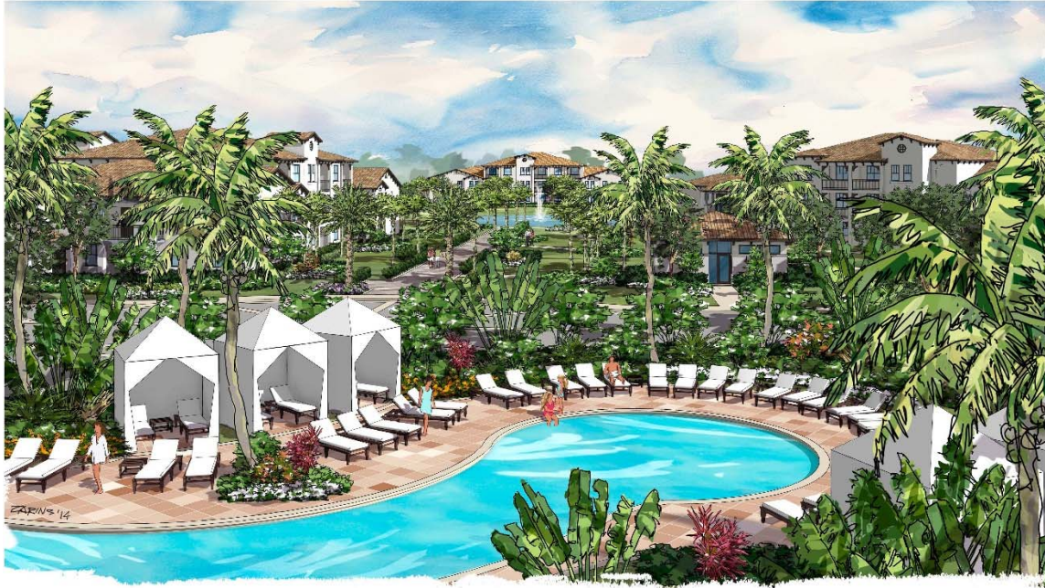
Above: Artist's rendering of the finished West Atlantic Boulevard Apartment site in Pompano Beach

The BSRA for the West Atlantic Boulevard Apartment Investors site in Pompano Beach was executed December 18, 2015, with West Atlantic Boulevard Apartment Investors, LLC. The site (also known as Residences at Palm Aire) is generally located at the northeast corner of the Turnpike and Atlantic Boulevard in Pompano Beach and was purchased by West Atlantic Boulevard Apartment Investors, LLC, in 2015. The site is also known as Phase 1 of the overall former Palm Aire Golf Course redevelopment project.