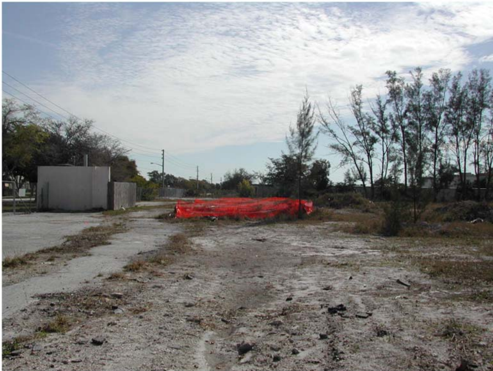
Above: The Pan American Brownfield Site in Coral Springs. The compound for the pump-and-treat remediation system is seen on the left.

The BSRA for the Pan American Brownfield site, which spans three (3) parcels at 12400, 12404, and 12408 NW 35 th Street in Coral Springs, was executed December 9, 2015. The Brownfield Area designation and BSRA are key to catalyzing reuse planning by the developer and its investors and lenders. While still in the conceptual design phase, redevelopment is focused on businesses that generate major job creation and leverage the site's proximity to over 1 million square feet of industrial warehouse space, one of the region's largest expressways, and a rapidly expanding employer base. Users that are being explored for this site include community banks, neighborhood retail, a business traveler's hotel, grocers with fresh produce, and pharmacies. It is anticipated that a formal redevelopment plan will be submitted to City of Coral Springs no later than September 2016 with groundbreaking occurring by March 2017. The site is expected to be fully developed and occupied prior to December 2017.