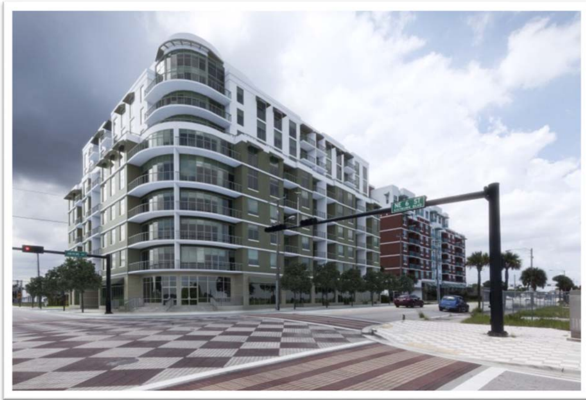
Above: Wisdom Village Crossing

Originally a warehouse and storage yard, arsenic was identified in site soils and groundwater above applicable cleanup target levels. After conducting a source removal of the impacted soils, site groundwater is being monitored until the end of calendar year 2017 in order to place an institutional control on groundwater use, after which time the issuance of Conditional Site Rehabilitation Completion Order will be proposed. Through the VCTC Program, $29,680.83 was awarded in corporate tax income credit associated with cleanup work conducted in calendar year 2016.