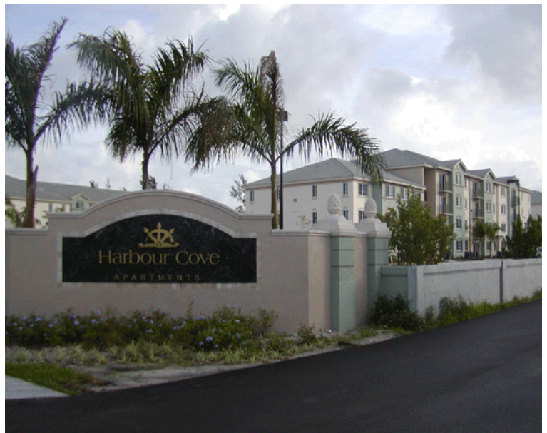
Above: Harbour Cove Apartments in Hallandale Beach.

After completing site assessment, a Monitoring Only Approval Order was issued to monitor the ammonia and petroleum-contaminated site groundwater in accordance with Chapter 62-785, Florida Administrative Code. Upon completing the prescribed monitoring to establish Alternative Groundwater Cleanup Target Levels, Harbour Cove enacted an institutional control for no groundwater use on the property. Soils contaminated with low concentrations of