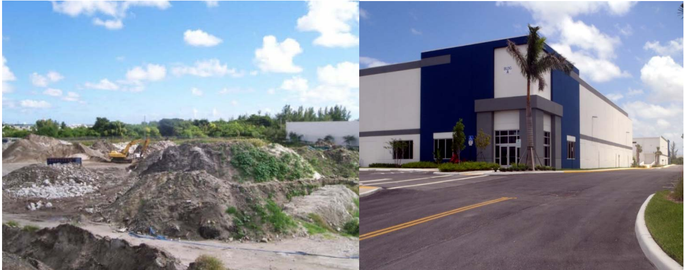
Above: The Dania Motocross Site in 2010 (left) and after rehabilitation and redevelopment in 2015 (right)

After conducting supplemental groundwater assessment, South Florida Sports Committee submitted a certified No Further Action with Conditions (NFAC) proposal to Broward County. Broward County approved the NFAC proposal on October 14, 2004, which established Alternative Groundwater Cleanup Target Levels and implemented a deed restriction prohibiting future groundwater use. A Conditional Site Rehabilitation Completion Order (SRCO) was issued by Broward County on August 1, 2006. During 2014, the site was redeveloped into a warehouse complex.