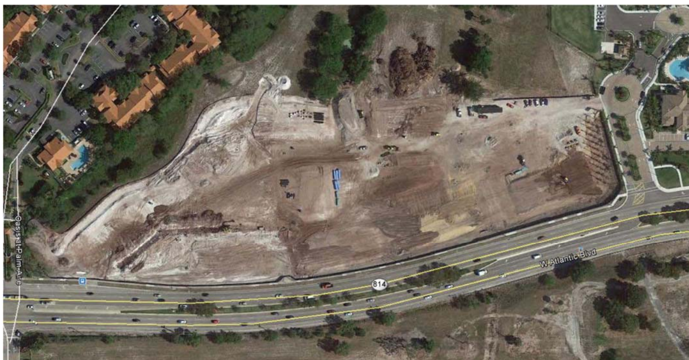
Above: Aerial view of the Former Palm Air Golf Course site in Pompano Beach. A portion of the nearly-completed West Atlantic Blvd. Apartments Investors, LLC, site (BF061503001) can be seen to the right.

The City of Pompano Beach has approved and permitted a 210-unit residential complex for the site with a total capital cost estimated at about $34 million called Atlantico at Palm Aire; it will consist of 9 new three-story multi-family buildings, a club house, tot lot, dog park, and a bike path. As of the date of this report, site clearing and preparation work has begun, including sewer and other utility installation.