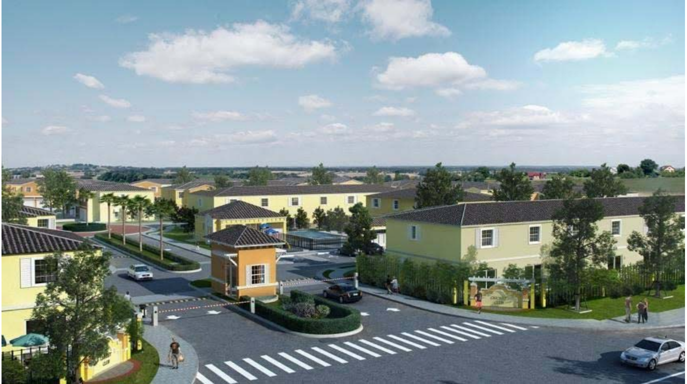
Above: Artist rendering of the Cricket Club (Courtesy: DRHorton)

MAS Development began site grading and earth-moving work in March 2017 and is going to build 155 townhomes. To be known as Cricket Club, the three-bedroom homes will have about 1,320 square feet of living space; prices will start in the mid-$200,000s. The community will have a clubhouse, playground, pool, and greenspace.