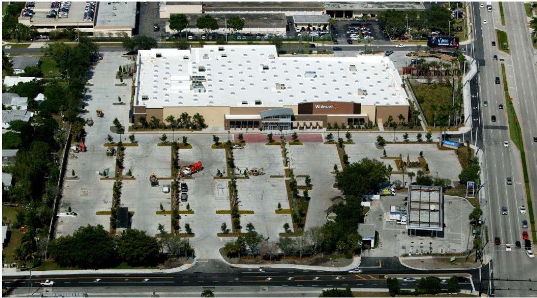
The Wal-Mart Neighborhood Market in Pompano Beach

Polynuclear aromatic hydrocarbon (PAH) and arsenic contamination was identified in site soils and groundwater. After completing soil removal efforts in 2013, the site groundwater was monitored and No Further Action with Conditions Proposal was approved on August 10, 2016. A Declaration of Restrictive Covenant is currently under review and will be executed to address the remaining contamination so that a Conditional SRCO may be issued.