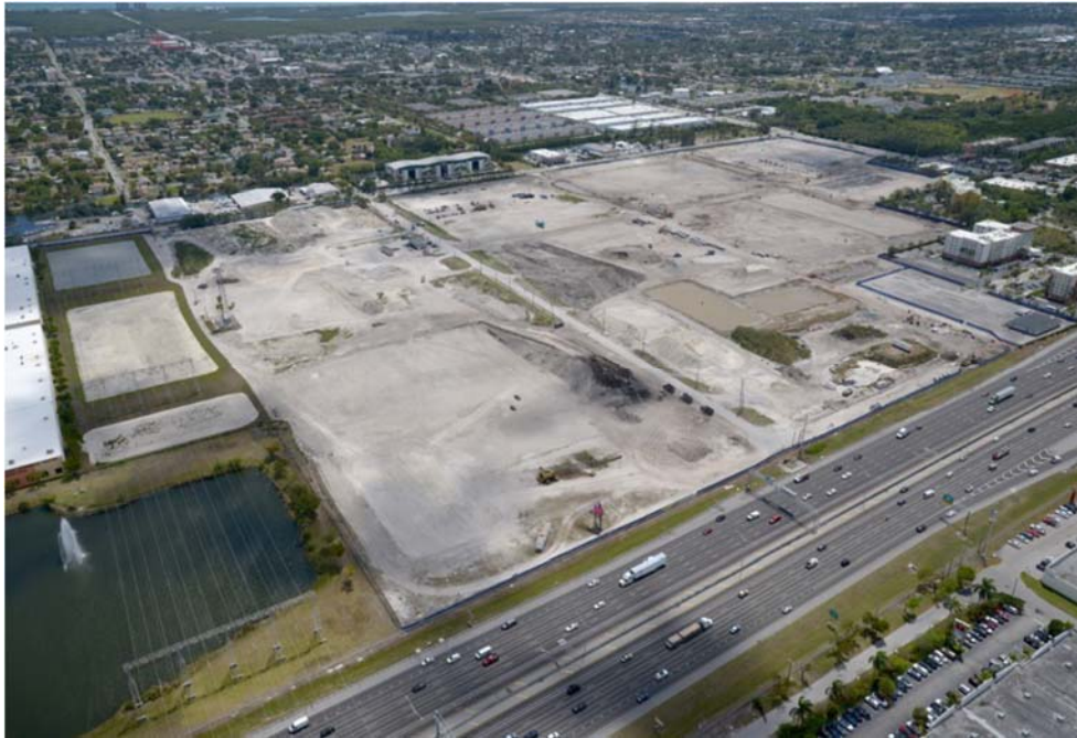
Aerial View of the Dania Pointe Brownfield Site under rehabilitation ( top ) and an artist rendering of the finished Dania Pointe development ( below )

During site assessment, arsenic and polynuclear aromatic hydrocarbons were identified above applicable CTLs on specific parcels within the site in soil and groundwater. On December 9, 2016, Broward County approved a Remedial Action Plan to perform source removal and soil management activities. Institutional and engineering controls will ultimately be utilized to seek a Conditional Site Rehabilitation Completion Order. Through the VCTC Program, $500,000 was awarded in corporate tax income credit associated with cleanup work conducted in calendar year 2016. For more information, see the Dania Pointe website at http://www.daniapointe.com/