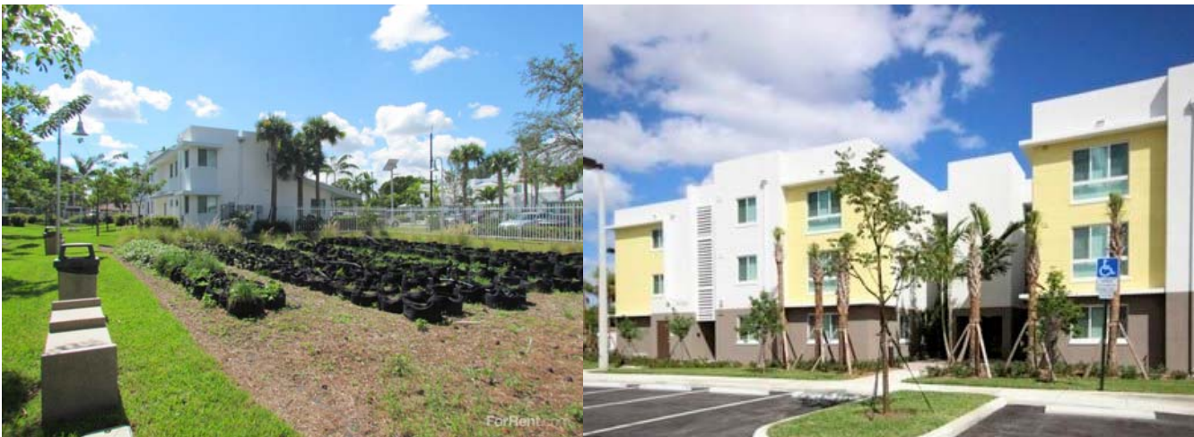
Above: Urban gardens and similar construction to the Northwest Gardens V Site in Fort Lauderdale

As a result of the Brownfield Area designation and the executed BSRA, the development partners were able to move forward with construction confidently, breaking ground on 100 new units and 100 renovated units in February 2016. Foundations have already been poured in four of the six new buildings. With major financial assistance from a sales tax refund on construction materials available to residential developers that provide affordable housing, construction is expected to conclude in December 2016, well ahead of schedule. The first residents are expected to move in prior to February 2017, and full occupancy is expected sometime in the second quarter of 2017. The project will offer a number of community-enhancing and capacity building amenities, including a fully furnished clubhouse, a computer lab, library, urban gardens, and a bocce ball court.