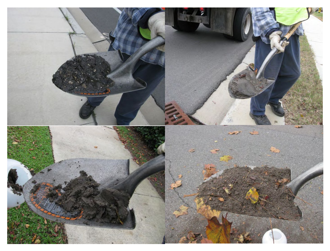
Figure 1: Visual indication of moisture content variability that can be observed in collected samples of solids that have been recovered during the MS4 study (can vary from dry to wet (top left)