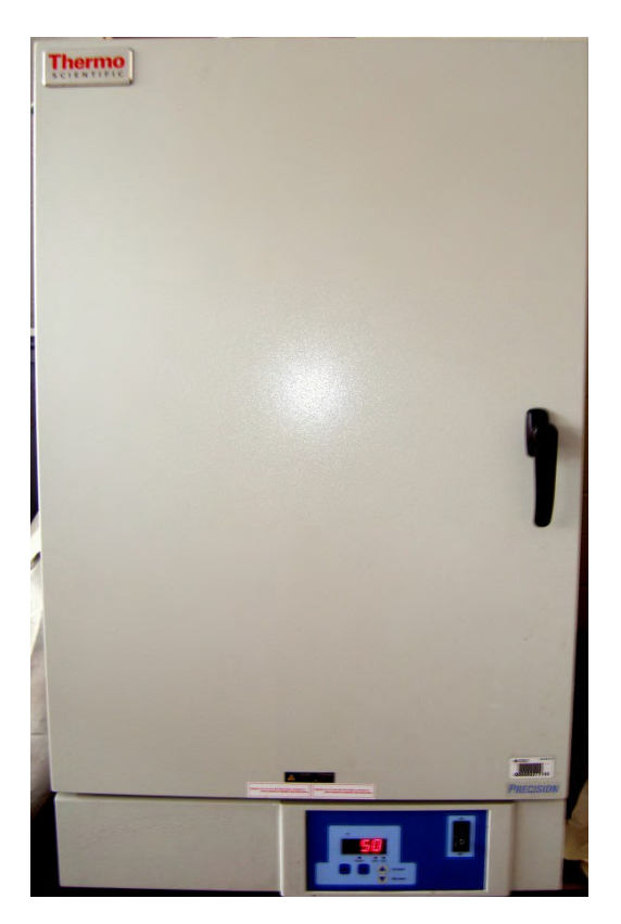
Figure 2: Oven set to 50 to 60 degrees C for drying out the collected sample placed in Pyrex dishes