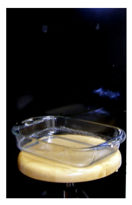
Figure 3: Pyrex baking dish for drying collected sample (clean and dry before pouring in sample)