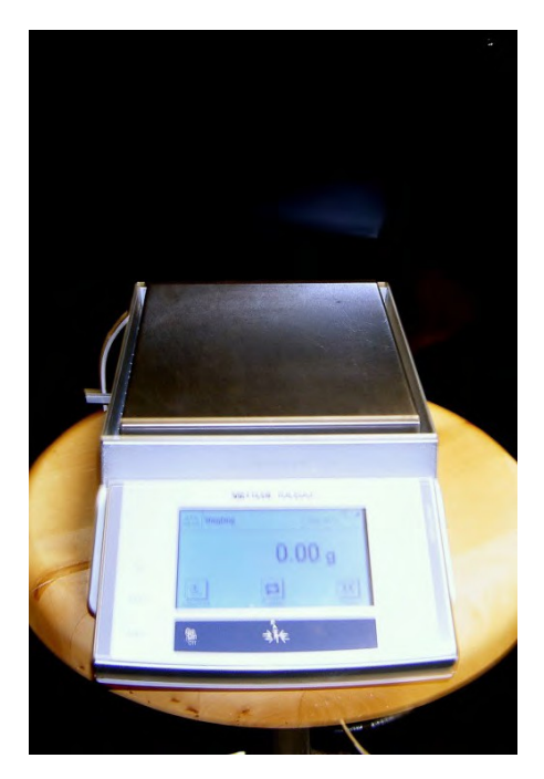
Figure 5: Top-loading weighing scale ('zero' scale before using)