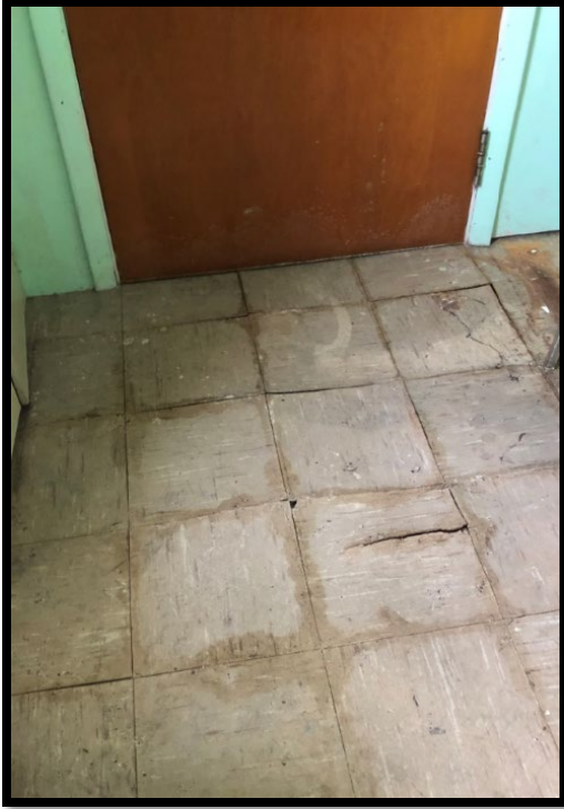
Figure 2.2 Water damage from roof collapse