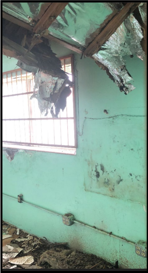
Figure 2.1 Damaged roof

The Miami-Dade County, Air Quality Management Division notified FDEP of a roof collapse at the Lab Annex site (AQS Site # 12-086-4002) on August 24, 2021. On August 26, 2021 FDEP was given EPA’s support in the decision to remove Miami-Dade staff and monitoring equipment from the unsafe conditions at the site and a final shut-down was established on August 31, 2021. Images of the site damage are shown in Figures 2.1, and 2.2, below.