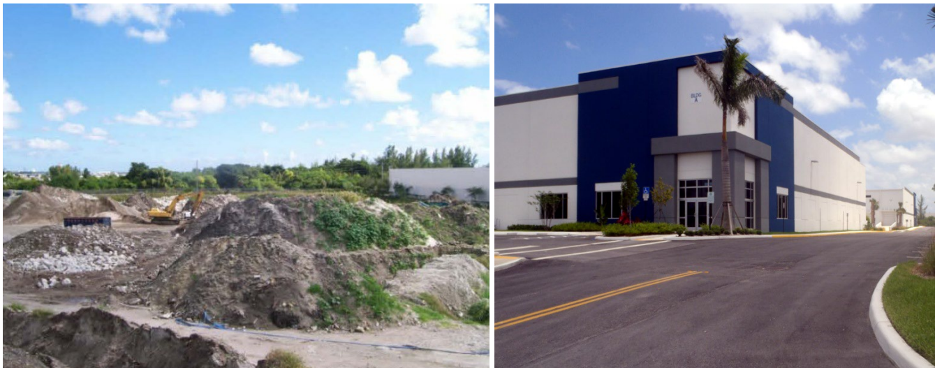
Above: The Dania Motocross Site in 2010 (left) and after rehabilitation and redevelopment in 2015 (right)

Prior to the time of BSRA execution, years of groundwater monitoring were performed at the facility under a Final Judgment entered on November 1, 1988, in the Circuit Court of the Seventeenth Judicial Circuit. The BSRA was executed to effectively utilize the risk-based corrective action techniques of the Brownfield Cleanup Criteria for lingering dissolved metals contamination (specifically consisting of manganese, iron, and aluminum) in groundwater.