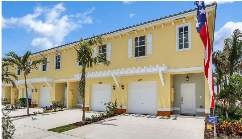
Above: Photo of Cricket Club, 2021

MAS Development began site grading and earth-moving work in March 2017 and has finished the construction of 155 townhomes. Known as Cricket Club, the three-bedroom homes begin at 1,446 square feet of living space; prices start in the upper-$200,000s. The community has a clubhouse, playground, pool, and greenspace.