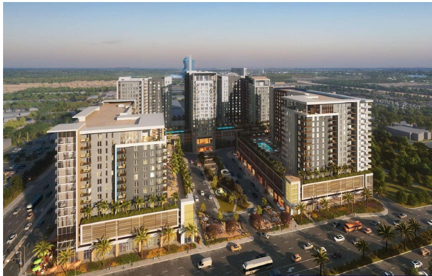
Above: Artist rendering of future El-Ad Broward Plaza redevelopment

The property is contaminated due to a discharge from an historical onsite dry-cleaning facility as well as a possible discharge from an offsite gas station on the adjacent parcel. Site assessment is ongoing in order to develop a remedial action plan in advance of redevelopment. Contamination will likely be addressed through a combination of excavation and disposal of contaminated soil, encapsulation of contaminated soil beneath approved engineering controls, and groundwater use restrictions to manage contaminated groundwater. Through the VCTC Program, $38,143.63 in corporate income tax credits were awarded for site rehabilitation work conducted in 2021.