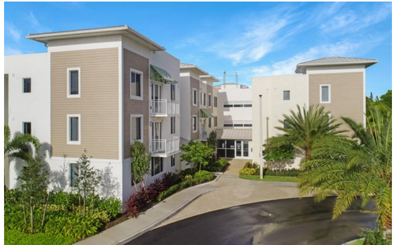
Above (left and right): Pinnacle at Peacefield