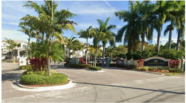
Above: Harbour Cove Apartments in Hallandale Beach.

After completing site assessment, a Monitoring Only Approval Order was issued to monitor the ammonia and petroleum-contaminated site groundwater in accordance with Chapter 62-785, Florida Administrative Code (Brownfield Rule in effect at the time). Upon completing the prescribed monitoring to establish Alternative Groundwater Cleanup Target Levels, Harbour Cove enacted an institutional control to prohibit groundwater use on the property. Soils contaminated with low concentrations of arsenic and polynuclear aromatic hydrocarbons have also been addressed through institutional and engineering controls. A Conditional SRCO was issued by Broward County on May 6, 2009.