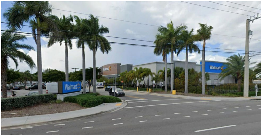
Above: The Wal-Mart Neighborhood Market in Pompano Beach

Polynuclear aromatic hydrocarbon and arsenic contamination was identified in site soils and groundwater. After completing soil removal efforts in 2013, the site groundwater was monitored and a No Further Action with Controls Proposal was approved on August 10, 2016. A Declaration of Restrictive Covenant was recorded on February 27, 2018, stipulating a restriction on groundwater use and a restriction to limit land use to commercial and industrial purposes. A Conditional SRCO was issued on October 8, 2018.