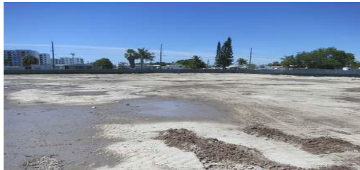
Above: The Atlantic Village site, before development. Below: Atlantic Village after development.

Atlantic Village 3, LLC is currently redeveloping the site as the third phase of the Atlantic Village at Hallandale Beach mixed use complex. The Atlantic Village 3 site, specifically, includes 15,000 square feet of retail and restaurant space, 52,500 square feet of office and medical space, and a 70-unit residential building. Construction of the project is now complete and the Certificate of Occupancy for the project is expected in 2022. For further information, see https://atlanticvillageone.com/