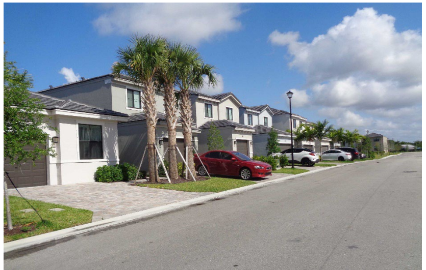
Above Left: Vantage at Palm Aire redevelopment plan Above Right: Completed row of homes, April 2021