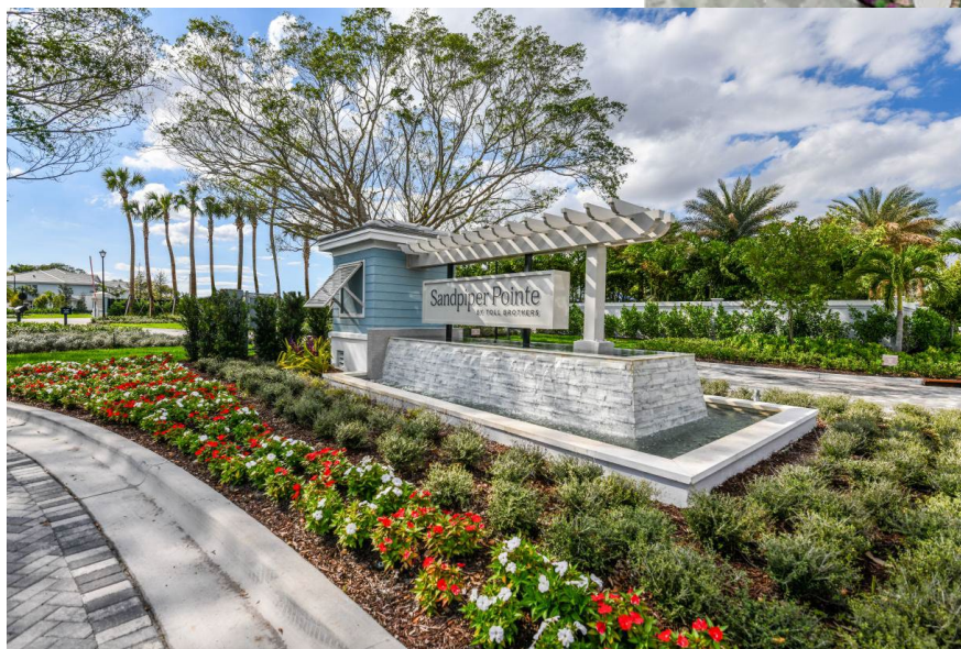
Above: Conceptual Site Plan and Entrance of Sandpiper Pointe residential development. (images courtesy of Toll Bros.)