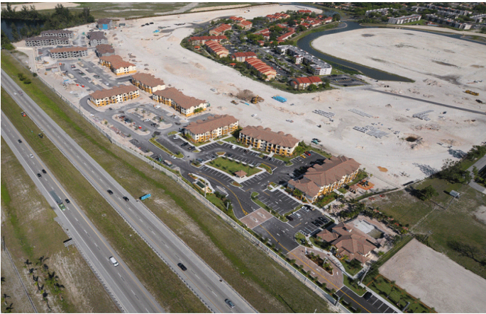
Above: Sorrento at Miramar (foreground) under construction on the ZF Brownfield Site (taken April 2012)

Prior to execution of the BSRA, site assessment had been conducted on the entire former Foxcroft Golf Course to determine the magnitude and extent of arsenic contamination in soil and groundwater pursuant to Chapter 62-780, Florida Administrative Code. The arsenic contamination stemmed from the application of herbicides on the former golf course. Groundwater contamination throughout the golf course was monitored for a period of one (1) year, and Broward County also approved a soil management strategy as a Remedial Action Plan.