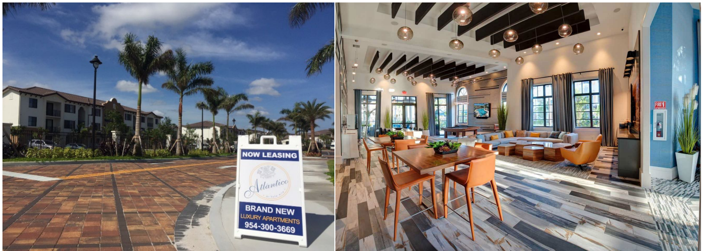
Above: Atlantico at Palm Aire

The City of Pompano Beach approved and permitted a 210-unit rental community for the site called Atlantico at Palm Aire, with a total capital cost estimated at $34 million. The development consists of nine (9) three-story multi-family buildings, a club house, tot lot, dog park, and a bike path. To date, site rehabilitation and construction of the complex are complete. A Declaration of Restrictive Covenant has been recorded to enact a groundwater use restriction and maintenance of engineering controls, and a Conditional SRCO was issued on September 20, 2018. Through the VCTC Program, FCI Development Ten LLC, received over $785,000 in corporate income tax credits for assessment and cleanup work.