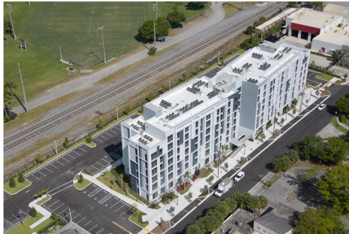
Above: Aerial photograph (2022) of the completed Poinciana Crossing development.

On May 13, 2020, Broward County approved a Soil Management Remedial Action Plan that proposed excavation and encapsulation of contaminated soils beneath engineering controls to consist of the building slab, concrete sidewalks, asphalt parking areas, and two feet of clean fill in landscaped areas. Poinciana Crossing started vertical construction of the development in late 2020 with additional contaminated soil management work and engineering control construction continuing through 2022. Poinciana Crossing expects residents to begin moving into the development in May 2022. Through the VCTC Program, $129,501.77 in corporate income tax credits were awarded for site rehabilitation work conducted in 2021.