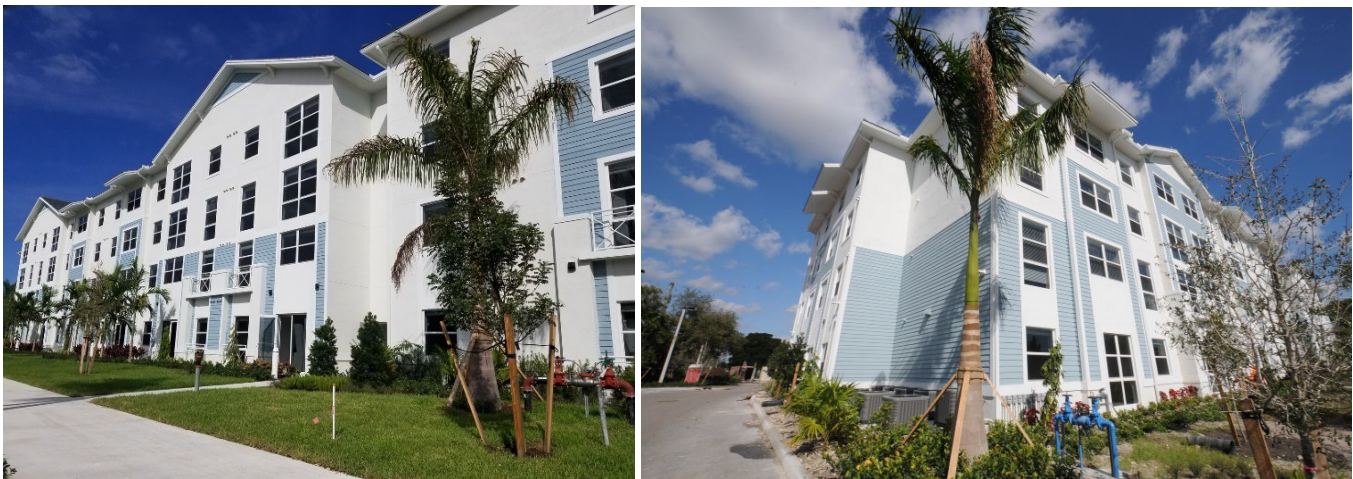
Above (left and right): the completed Saratoga Crossings Development

Contamination at the site consists of arsenic in soils and groundwater that is likely tied to the property's historical agricultural usage. On February 22, 2019, Broward County approved a Remedial Action Plan that included plans to excavate areas of arsenic-contaminated soil for reuse onsite to raise the elevation of building pads constructed for the apartment buildings. Remaining contaminated soils and groundwater is being addressed through engineering and institutional controls instituted by a recorded Declaration of Restrictive Covenant. A Conditional SCRO was issued on February 22, 2022. To date, redevelopment is complete with 100% of the units occupied. Through the VCTC Program, $33,915 in corporate income tax credit has been awarded to offset the costs of rehabilitation.