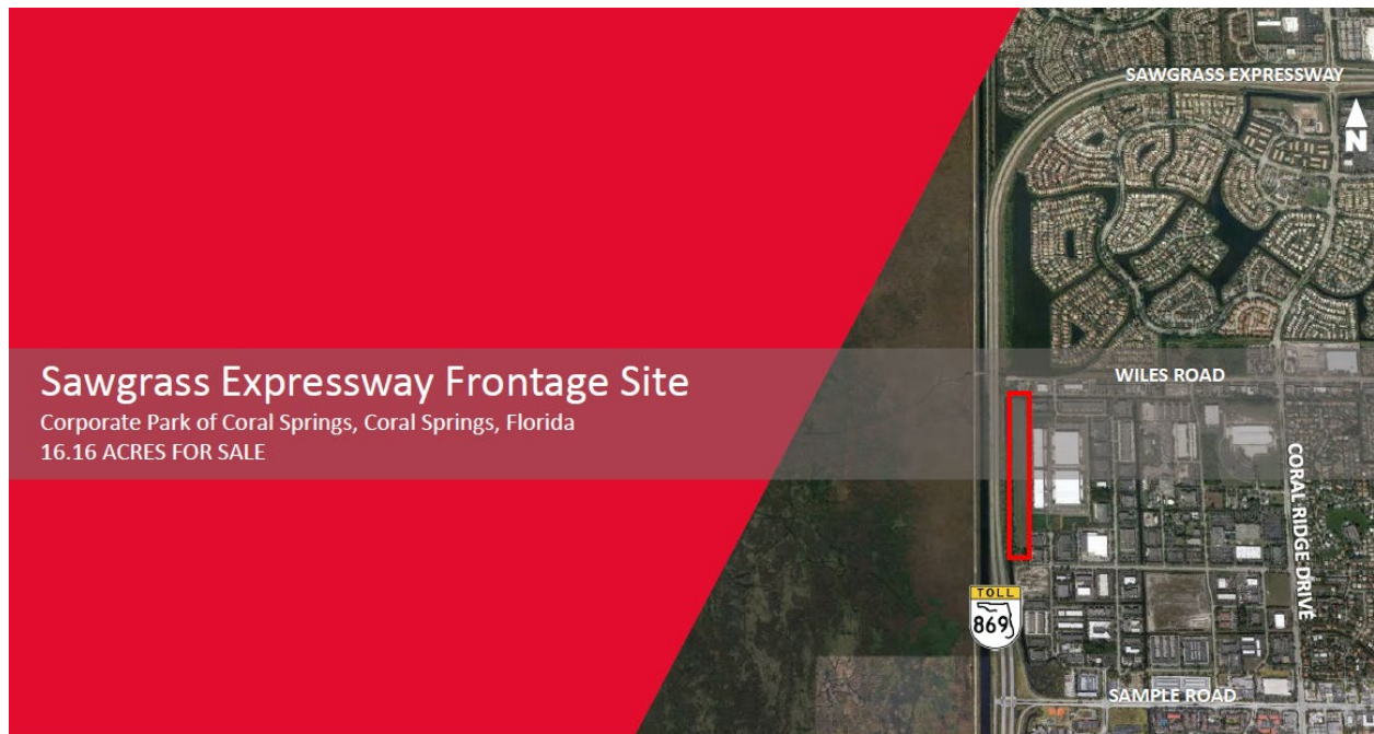
Above: Aerial view of Coral Springs Economic Revitalization Zone Two, outlined in red.

The BSRA for the Coral Springs Economic Revitalization Zone Two was executed on June 12, 2019, by Sawgrass Development Partners, LLC (“Sawgrass”), which allowed Sawgrass to relieve the City of ongoing cleanup costs and accelerate the timeframe for obtaining regulatory closure. The SRCO was issued on December 19, 2019. Through the VCTC Program, approximately $47,897 in corporate income tax credits have been awarded to offset rehabilitation costs. Potential developments include warehousing and distribution facilities for e-commerce platforms and/or fleet storage for last mile deliveries of groceries and merchandise.