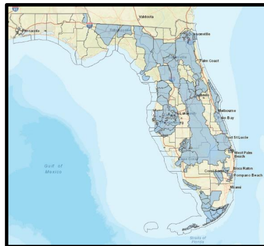
Area impacted by HB 1379 requirements for lots one acre or less starting July 1, 2023.

Effective January 1, 2024 , HB 1379 requires nitrogen-reducing systems for new septic systems serving lots of all sizes within the Indian River Lagoon Protection Program area (parts of Brevard, Indian River, St. Lucie and Volusia counties). New septic system construction permit applications for all lots in this area must comply with enhanced nutrient-reducing system requirements unless they were received prior to January 1, 2024 and have been determined complete (except for the site evaluation). In addition, by January 1, 2030, any commercial or residential property with an existing septic system located within this area must connect to central sewer (if available) or upgrade to a nitrogen-reducing system or other wastewater treatment system that achieves at least 65 percent nitrogen reduction.