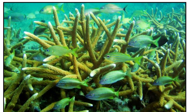
Branching species, such as Staghorn coral ( Acropora cervicornis ), are generally more susceptible to bleaching.

Not all corals are affected by bleaching in the same way. Different species and growth forms of corals have different susceptibilities to bleaching. Since all reef communities are composed of a different mix of corals, often some reefs are more badly affected than others. Also, levels of climate and environmental stress can vary among reefs, leading to differences in the amount of bleaching seen at different locations. This leads to many unanswered questions about mass bleaching and the resilience of different reef communities.