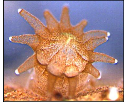
Healthy polyp showing zooxanthellae ( Porites astreoides ).

Corals are composed of animals called coral polyps ( see photo right ), which secrete hard, limestone skeletons. A single coral colony is made up of numerous individual coral polyps. These polyps receive up to 90% of their energy requirements from microscopic algae known as zooxanthellae that live within their tissues and provides them with carbohydrates and oxygen through photosynthesis. While the density of zooxanthellae varies in individual species of corals, they are usually golden brown in color and responsible for much of the normal “healthy” coloration of coral. Stressed corals may lose or expel zooxanthellae, which leaves behind the transparent coral tissue and reveals the underlying white skeleton, giving the coral a bleached white appearance. This process is called coral bleaching.