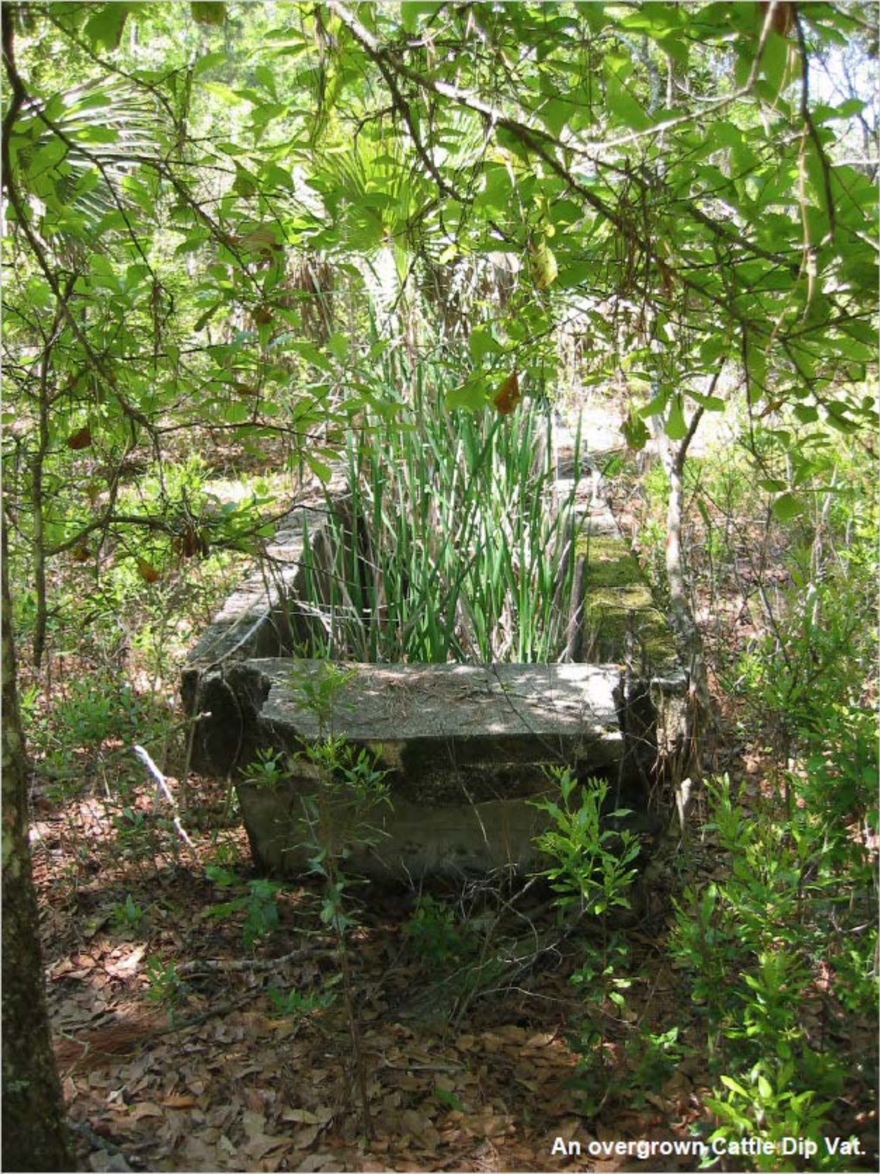
An overgrown Cattle Dip Vat.