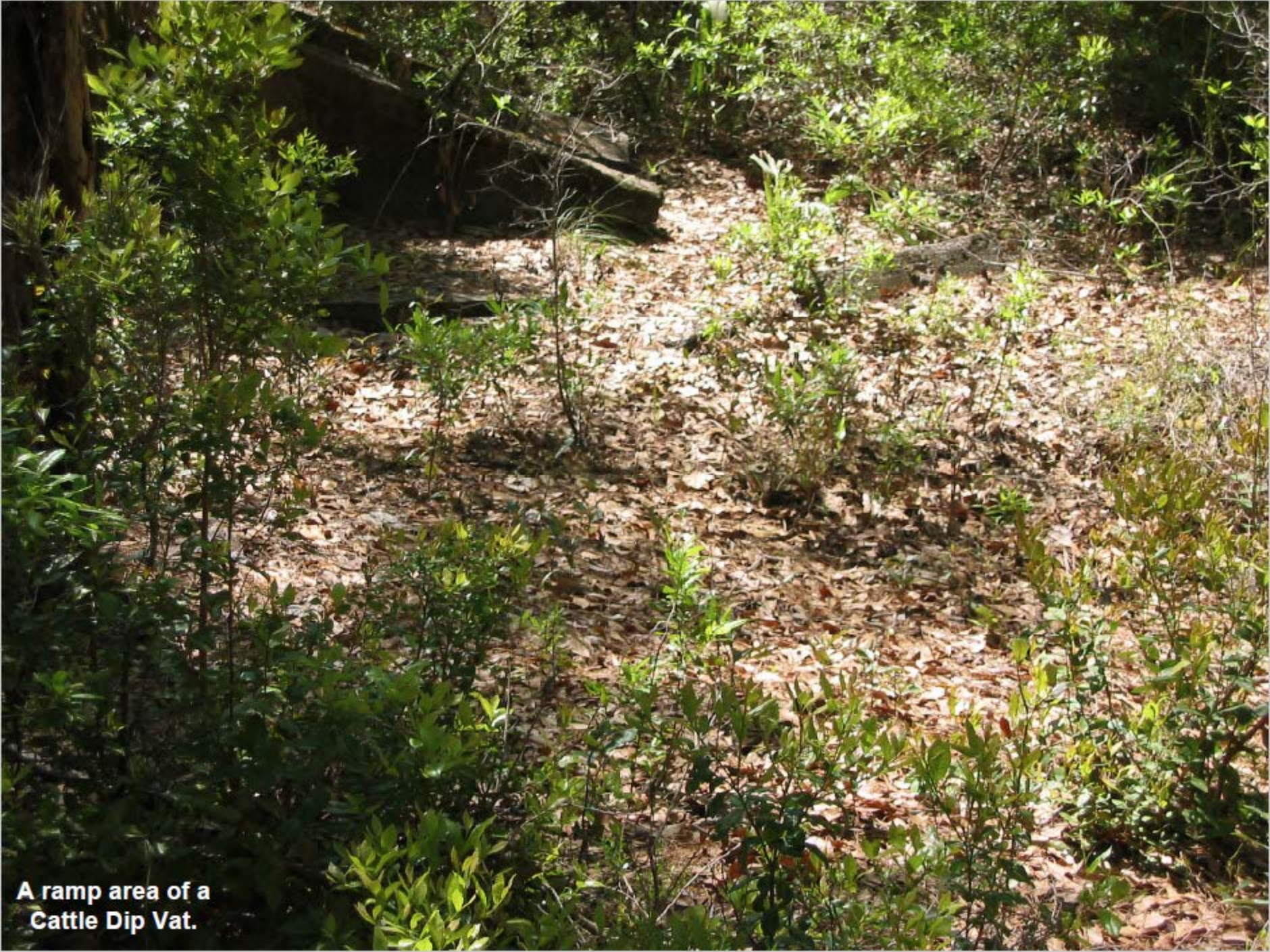
A ramp area of a Cattle Dip Vat.