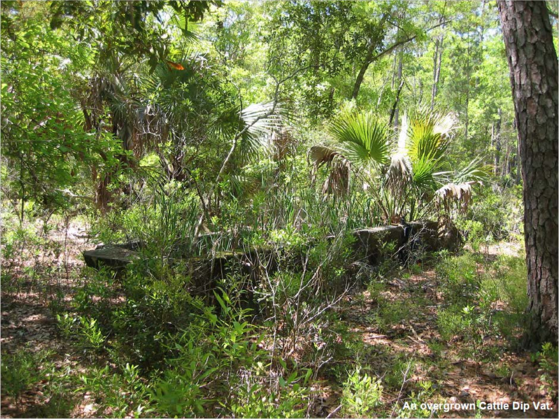
An overgrown Cattle Dip Vat.