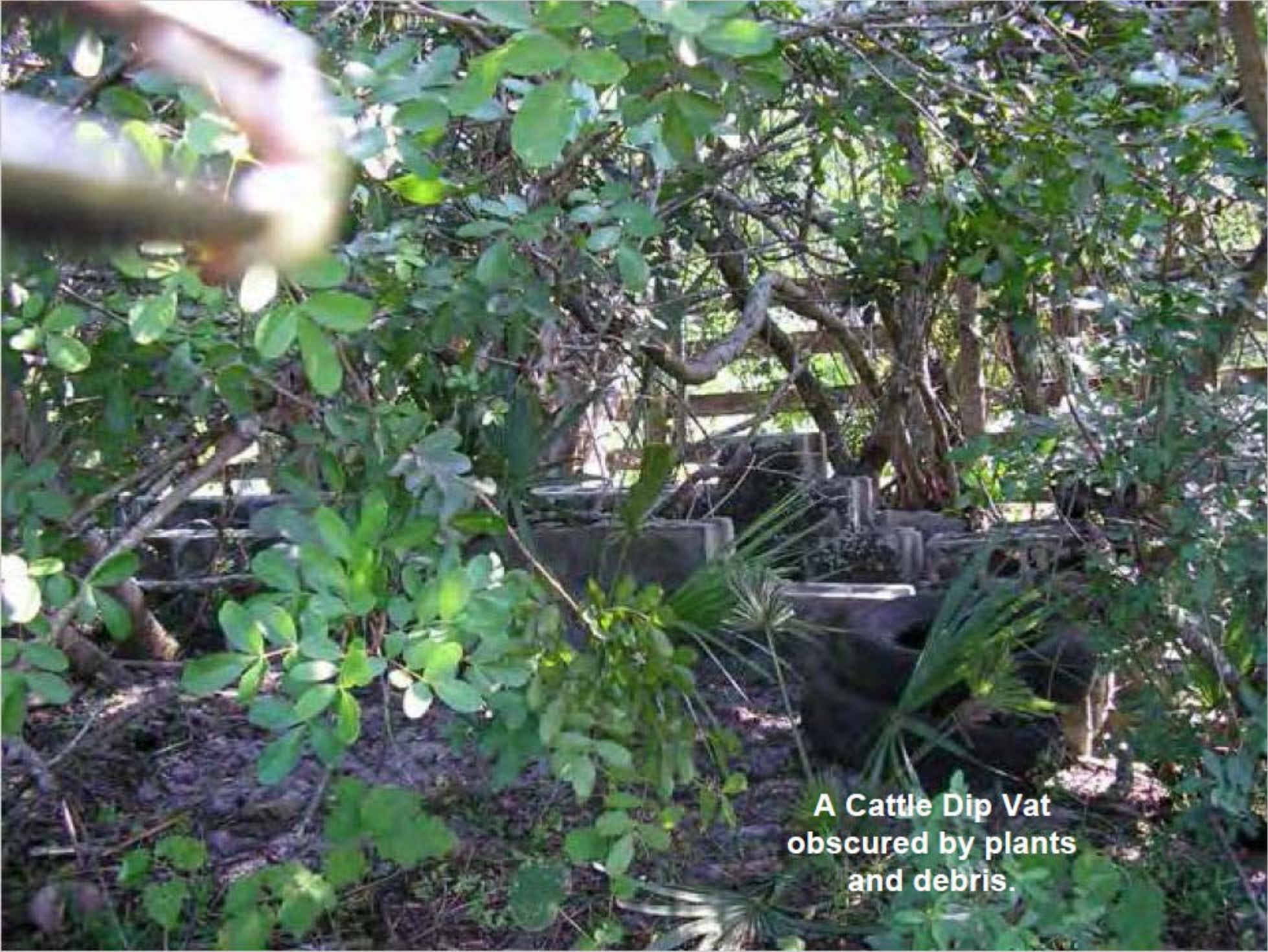
A Cattle Dip Vat obscured by plants and debris.