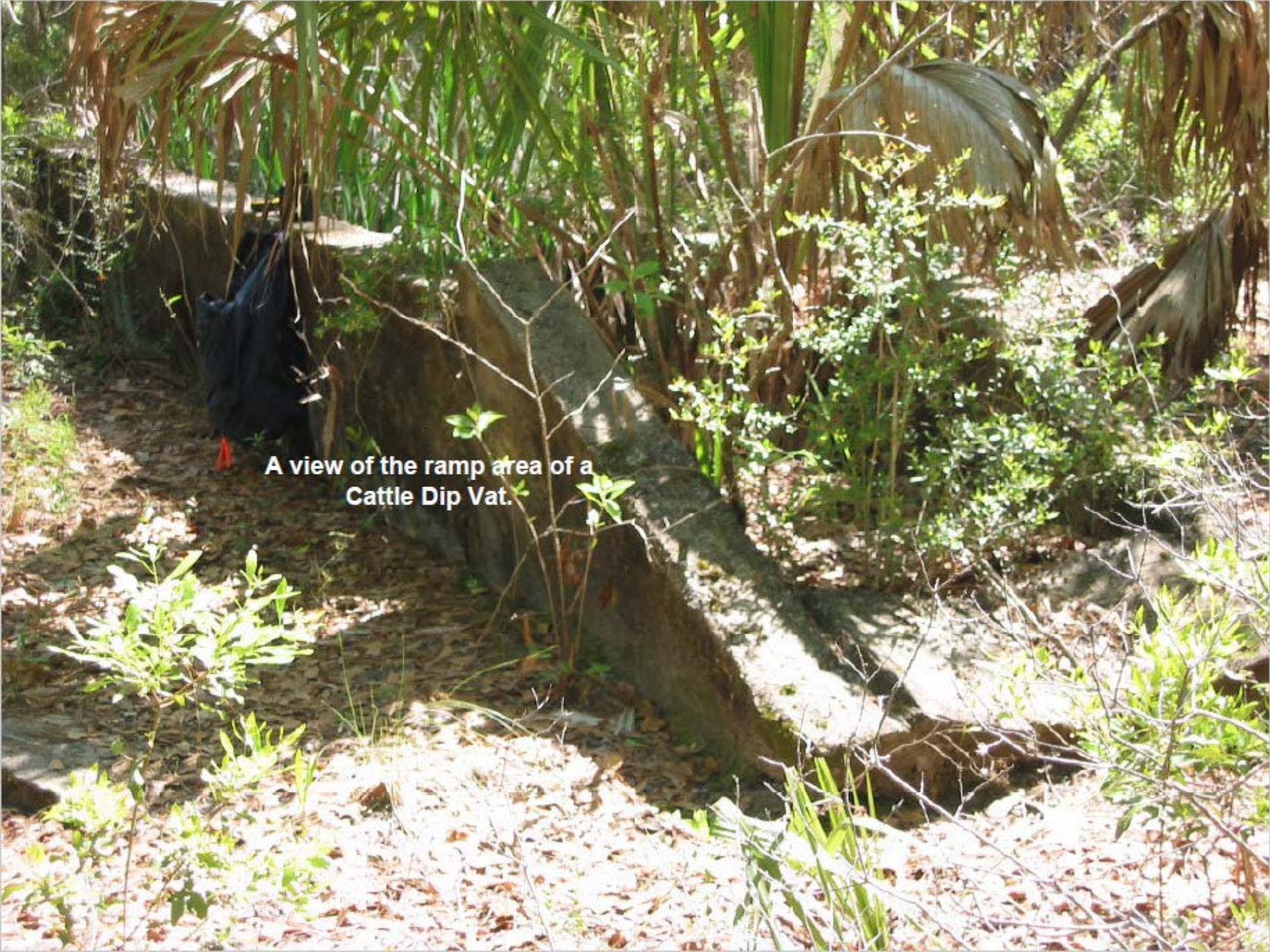
A view of the ramp area of a Cattle Dip Vat.