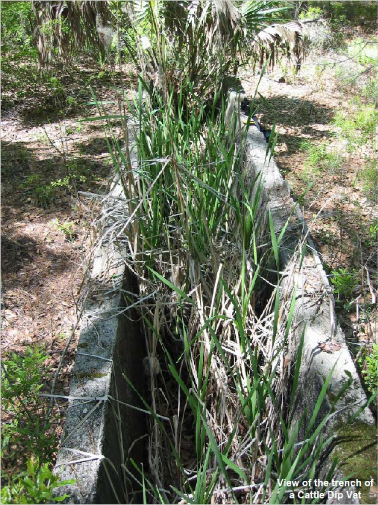
View of the trench of a Cattle Dip Vat