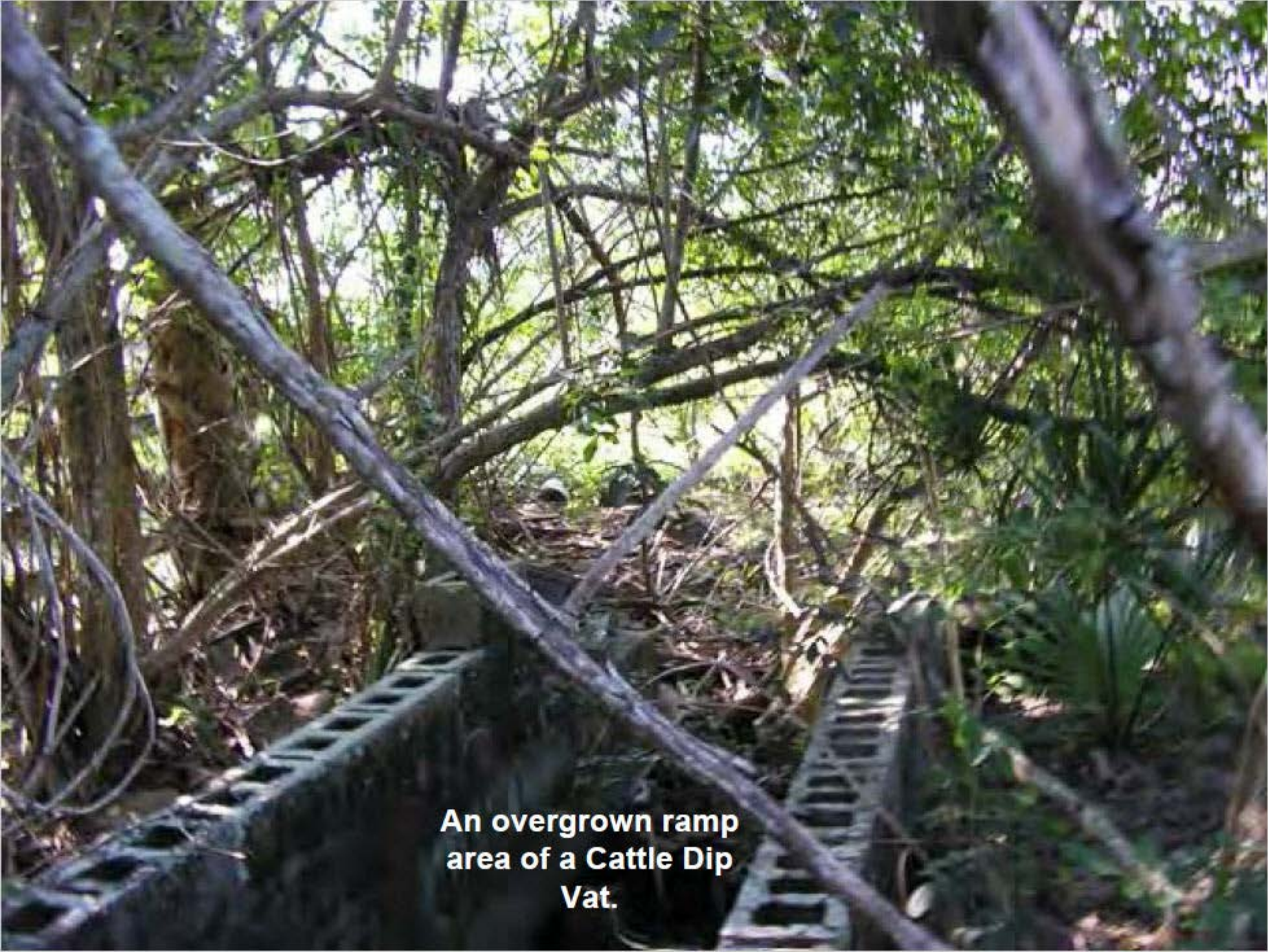
An overgrown ramp area of a Cattle Dip Vat.