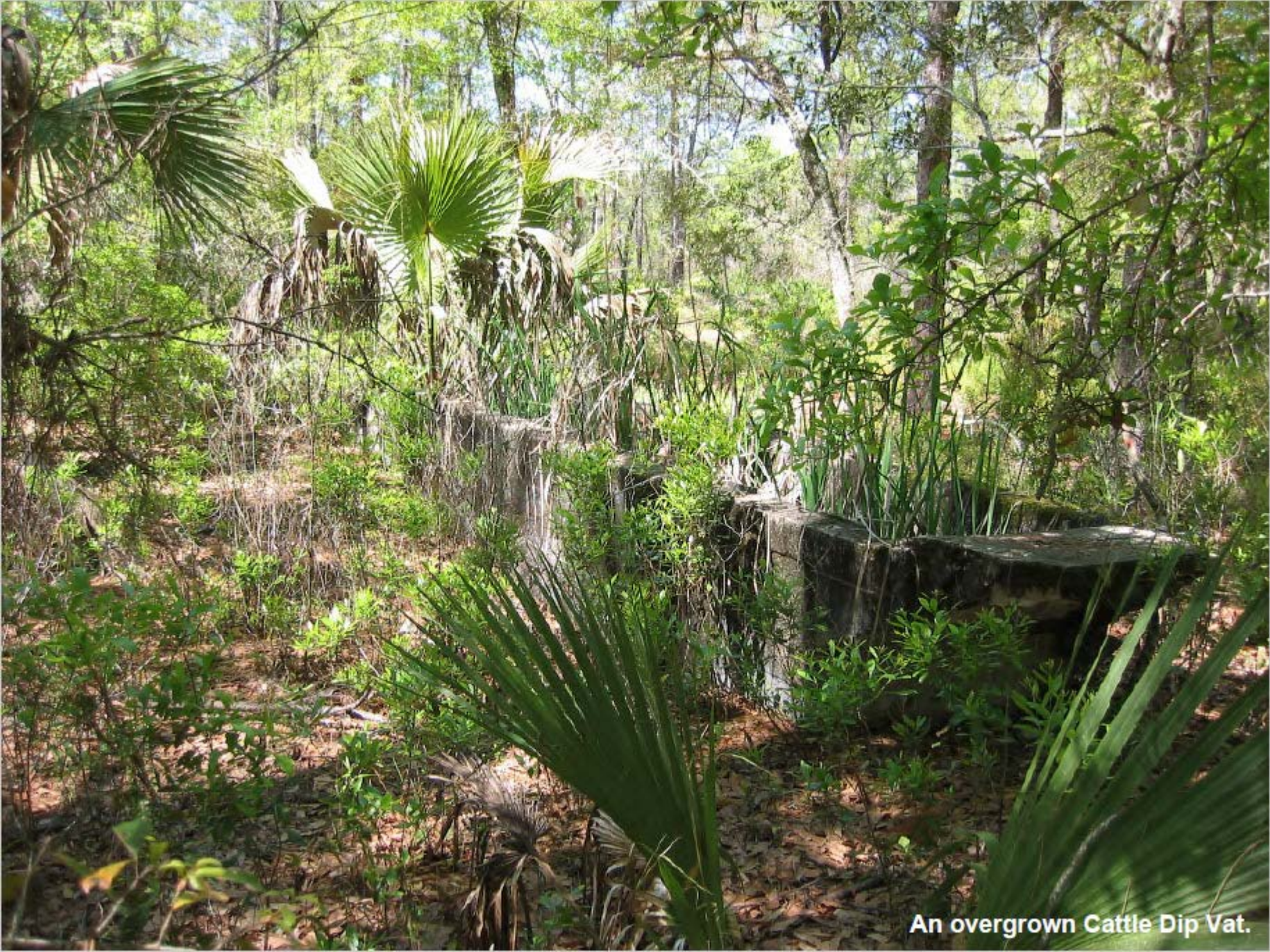
An overgrown Cattle Dip Vat.