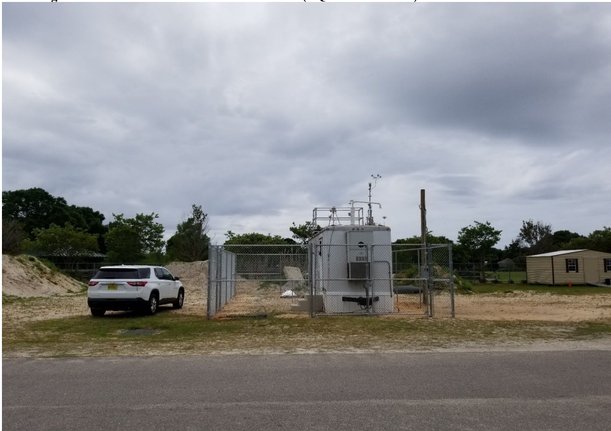
Figure 7.1 North from FWB Stillwell Park Site (AQS # 12-091-0003)

Photos and Wind Rose for the Okaloosa County: Fort Walton Beach Stillwell Park Site (AQS # 12-091-0003)