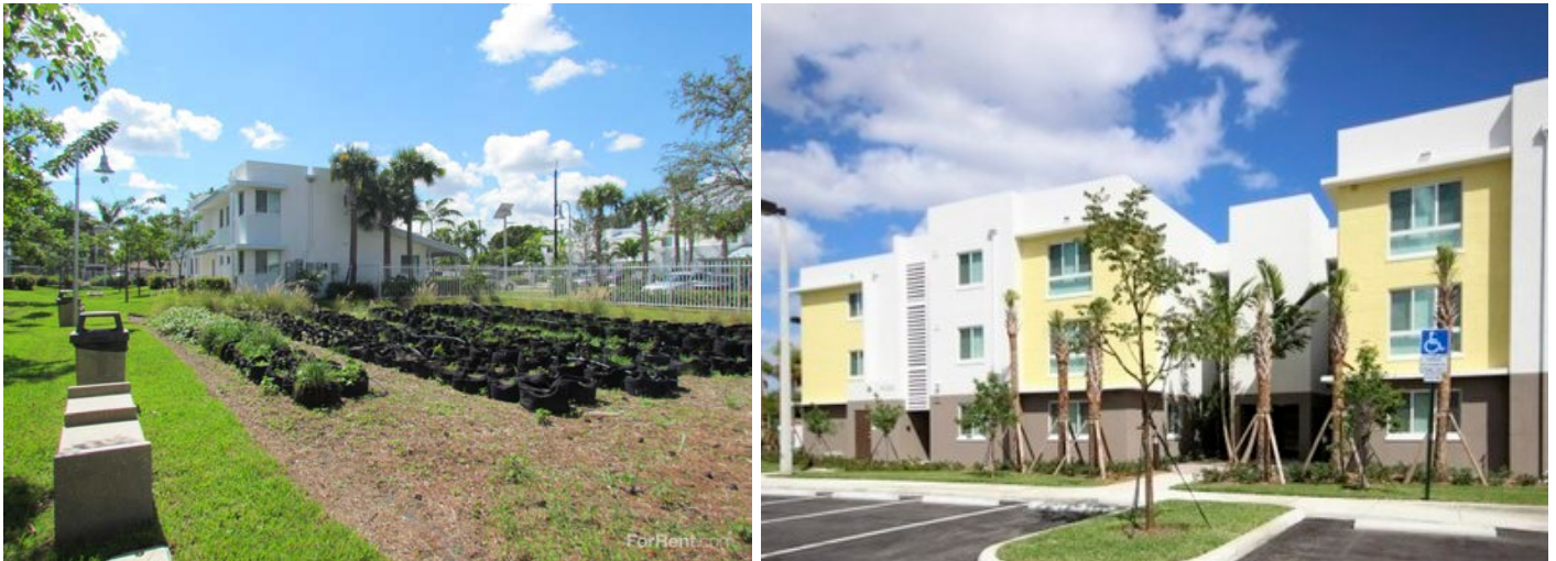
Above: Urban gardens and similar construction to the Northwest Gardens V Site in Fort Lauderdale

The contamination identified on the site consists of arsenic and polynuclear aromatic hydrocarbons in soil at concentrations greater than applicable FDEP Direct Exposure Soil Cleanup Target Levels within (and limited to) the top two-foot interval below land surface. After completing the proper removal and closure of an abandoned Underground Storage Tank, source removal of contaminated soils, and groundwater monitoring, a No Further Action with Controls was approved on December 4, 2017. A Declaration of Restrictive Covenant was drafted to place engineering controls over portions of the site and a Conditional Site Rehabilitation Completion Order was issued on February 14, 2020. Through the VCTC Program, $33,465 in corporate tax income credit has been granted in association with cleanup work.