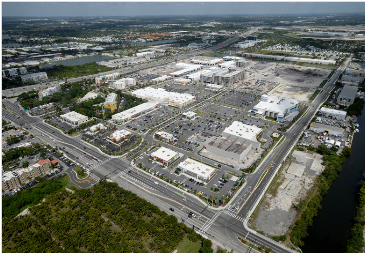
Top: aerial view of the Dania Pointe Brownfield Site under redevelopment in April 2019 Below: picture of the entrance of the finished Dania Pointe development

During site assessment, arsenic and polynuclear aromatic hydrocarbons were identified above applicable cleanup target levels on specific parcels within the site soil and groundwater. On December 9, 2016, Broward County approved a Remedial Action Plan to perform source removal, soil management, and groundwater monitoring activities, which were completed in 2020. Institutional controls in the form of land use and groundwater restrictions are being placed on parcels within the Dania Pointe as construction phases are completed through 2023. Once all restrictions are in place, a Conditional Site Rehabilitation Completion Order will be issued. Through the VCTC Program, over $1,325,000 in corporate income tax credits has been granted to date for assessment and cleanup work. For more information, see the Dania Pointe website at http://www.daniapointe.com/