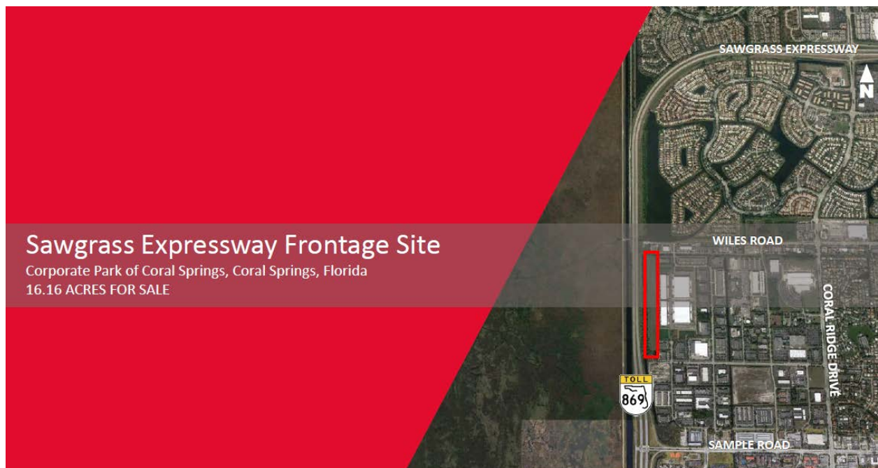
Above: Aerial view of Coral Springs Economic Revitalization Zone Two, outlined in red.

The BSRA for the Coral Springs Economic Revitalization Zone Two was executed on June 12, 2019, by Sawgrass Development Partners, LLC (“Sawgrass”), which allowed Sawgrass to relieve the City of ongoing cleanup costs and accelerate the timeframe for obtaining regulatory closure. The Site Rehabilitation Completion Order was issued on December 19, 2019. Through the VCTC Program, approximately $47,897 in corporate income tax credits have been awarded to offset rehabilitation costs. Current reuse scenarios are heavily influenced by the way in which the COVID-19 pandemic is affecting the marketplace. Potential developments include warehousing and distribution facilities for e-commerce platforms and/or fleet storage for last mile deliveries of groceries and merchandise.