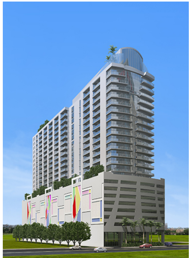
Above Left: The Gulfstream Point site, currently. Above Right: Artist's rendering of future development