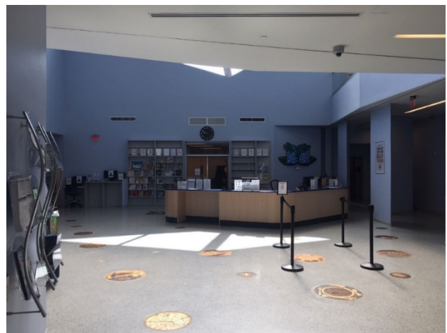
Above left and right: The completed Civic Plaza and the completed interior of the library lobby