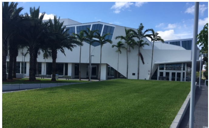
Above left and right: The Library and Civic Campus under construction and completed.