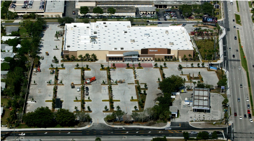
Above: The Wal-Mart Neighborhood Market in Pompano Beach

Polynuclear aromatic hydrocarbon and arsenic contamination was identified in site soils and groundwater. After completing soil removal efforts in 2013, the site groundwater was monitored and a No Further Action with Controls Proposal was approved on August 10, 2016. A Declaration of Restrictive Covenant was recorded on February 27, 2018, stipulating a restriction on groundwater use and a restriction to limit land use to commercial and industrial purposes. A Conditional SRCO was issued on October 8, 2018.