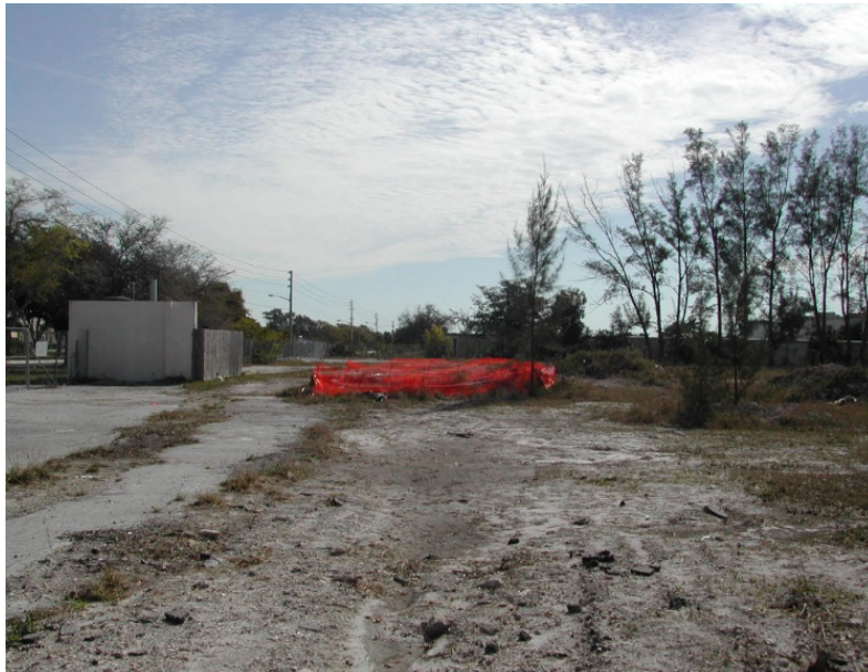
Above: The Pan American Brownfield Site in Coral Springs. The compound for the pump-and-treat remediation system is seen on the left.

The BSRA for the Pan American Brownfield Site, which spans three (3) parcels at 12400, 12404, and 12408 NW 35 th Street in Coral Springs, was executed December 9, 2015. The Brownfield Area designation and BSRA are key to catalyzing reuse planning by the developer and its investors and lenders. While still in the conceptual design phase, redevelopment is focused on businesses that generate major job creation and leverage the site's proximity to over 1 million square feet of industrial warehouse space, one of the region's largest expressways, and a rapidly expanding employer base. Uses that are being explored for this site include community banks, neighborhood retail, a business traveler's hotel, grocers with fresh produce, and pharmacies.