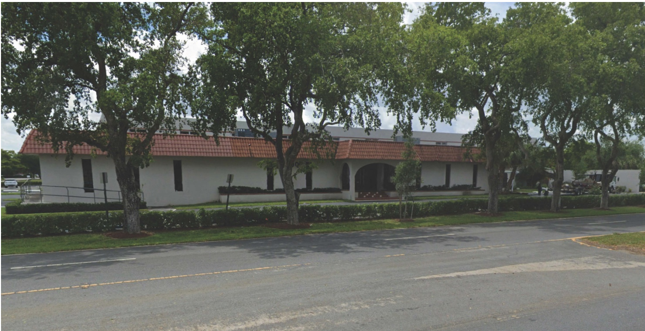
Above: 2700 Gateway Green Reuse

Contamination at the site historically included soil and groundwater contamination by volatile organic compounds and chlorinated solvents related to the chemical manufacturing process. Site rehabilitation thus far has been carried out pursuant to a consent order between the Florida Department of Environmental Protection (“FDEP”) and the property owner as well as a Remedial Action Plan approved by FDEP on December 28, 2018. Much of the contaminated soil on the property has been removed and disposed of off-site with the only remaining contaminated soils located beneath the existing building footprint. Groundwater remediation is ongoing and being addressed via a hydraulic control and treatment system that has successfully treated over 80 million gallons of groundwater and removed over 3,500 pounds of contaminants. Groundwater remediation continued via in-situ bioremediation and monitoring efforts which are now being reported on a semi-annual basis. Belmont Porten Properties plans to achieve regulatory closure of the site through a mixture of institutional and engineering controls using a layered approach of local ordinances and a Declaration of Restrictive Covenant. Through the VCTC Program, $82,259 in corporate income tax credits were awarded to offsite site rehabilitation work conducted in 2019, and an application for an additional $72,680 in tax credits applicable to 2020 is pending review.