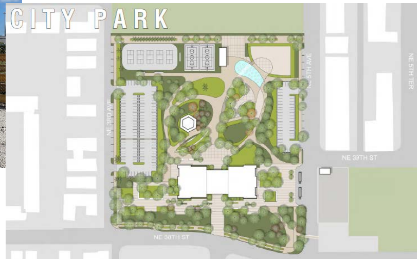
Above Left: The current fire station and fleet services yard at 2700 Gateway Green Reuse Site Above Right: The re-imagined conceptual plan for City Park