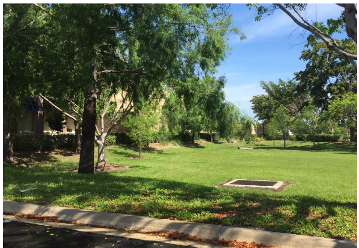
Above Left: The completed Wal-Mart stores in Sunrise Above Right: Dry retention area at back of the store