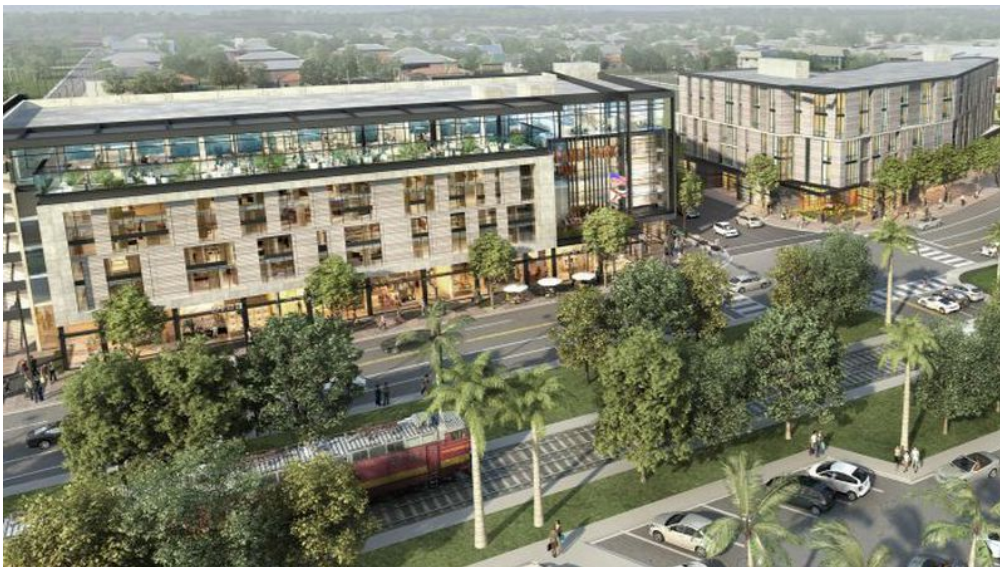
Above: Artist's rendering of the City of Oakland Park's new municipal complex