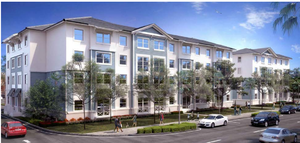
Above: Artist's rendering of the completed Saratoga Crossings II Development

Contamination at the site consists of arsenic in soils and groundwater above applicable cleanup target levels. On February 22, 2019, Broward County approved a Remedial Action Plan that, much like Saratoga Crossings I, set forth plans to excavate areas of arsenic-contaminated soil for reuse onsite beneath the building pads for the new apartment buildings. Arsenic-contaminated groundwater is being addressed through a quarterly monitoring only plan which remains in progress. Contaminated soils encapsulated beneath the building pads and remaining contaminated groundwater will be addressed through engineering and institutional controls instituted by a recorded Declaration of Restrictive Covenant in pursuit of a Conditional Site Rehabilitation Completion Order. Redevelopment of the site is complete and nearly all the units are currently occupied. Through the VCTC Program, $11,275 has been awarded in corporate income taxes to offset the costs of site rehabilitation.