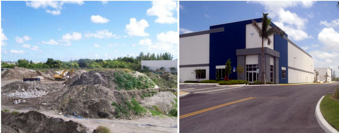
Above: The Dania Motocross Site in 2010 (left) and after rehabilitation and redevelopment in 2015 (right)

Prior to the time of BSRA execution, years of groundwater monitoring were performed at the facility under a Final Judgment entered on November 1, 1988, in the Circuit Court of the Seventeenth Judicial Circuit. The BSRA was executed to effectively utilize the risk-based corrective action techniques of the Brownfield Cleanup Criteria for lingering dissolved metals contamination (specifically consisting of manganese, iron, and aluminum) in groundwater.