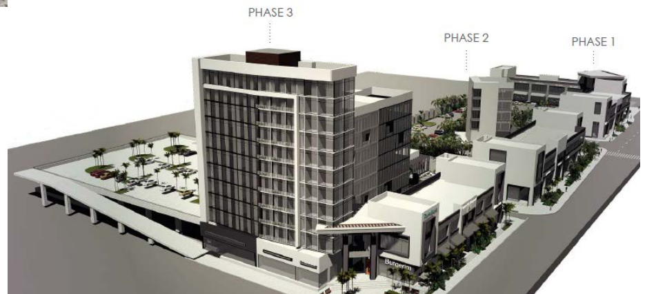
Above Left: The Atlantic Village site, currently. Above Right: Artist's rendering of future development