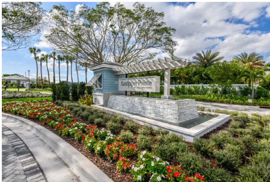
Above: Conceptual Site Plan and Entrance of Sandpiper Pointe residential development. (images courtesy of Toll Bros.)