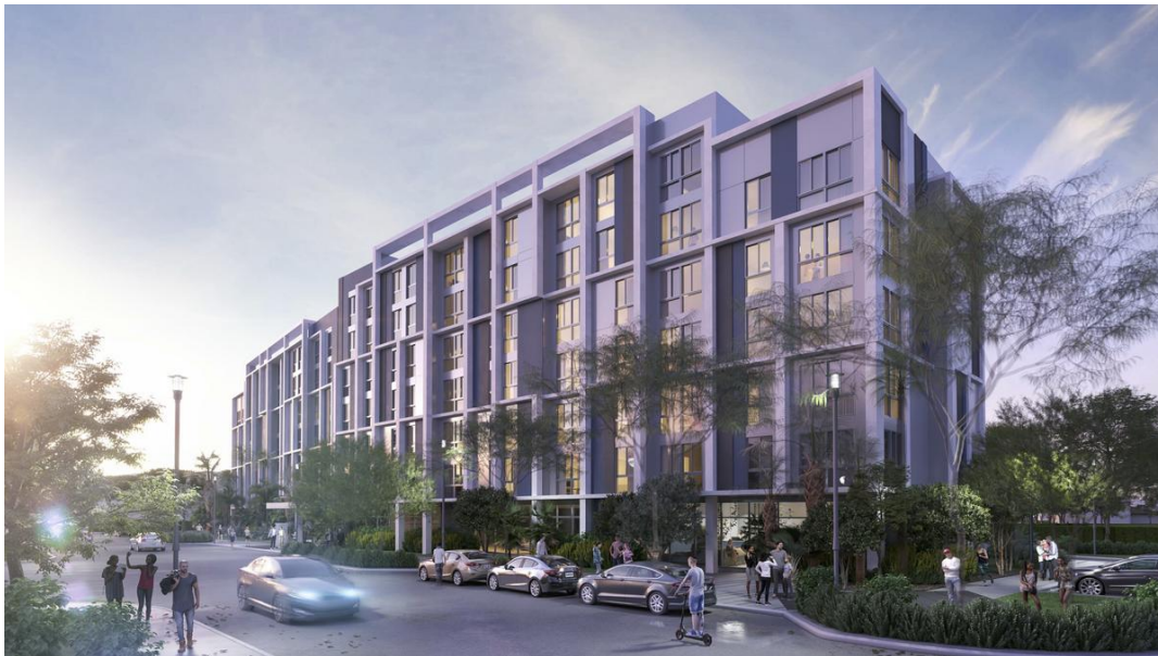
Above: Artist rendering of the completed Poinciana Crossing development.

On May 13, 2020, Broward County approved a Soil Management Remedial Action Plan that proposed excavation and encapsulation of contaminated soils beneath engineering controls to consist of the building slab, concrete sidewalks, asphalt parking areas, and two feet of clean fill in landscaped areas. Poinciana Crossing started vertical construction of the development in late 2020 with additional contaminated soil management work and engineering control construction expected to continue throughout 2021. Poinciana Crossing expects to complete site rehabilitation as well as construction of the residential building and engineering controls in the fourth quarter of 2021.