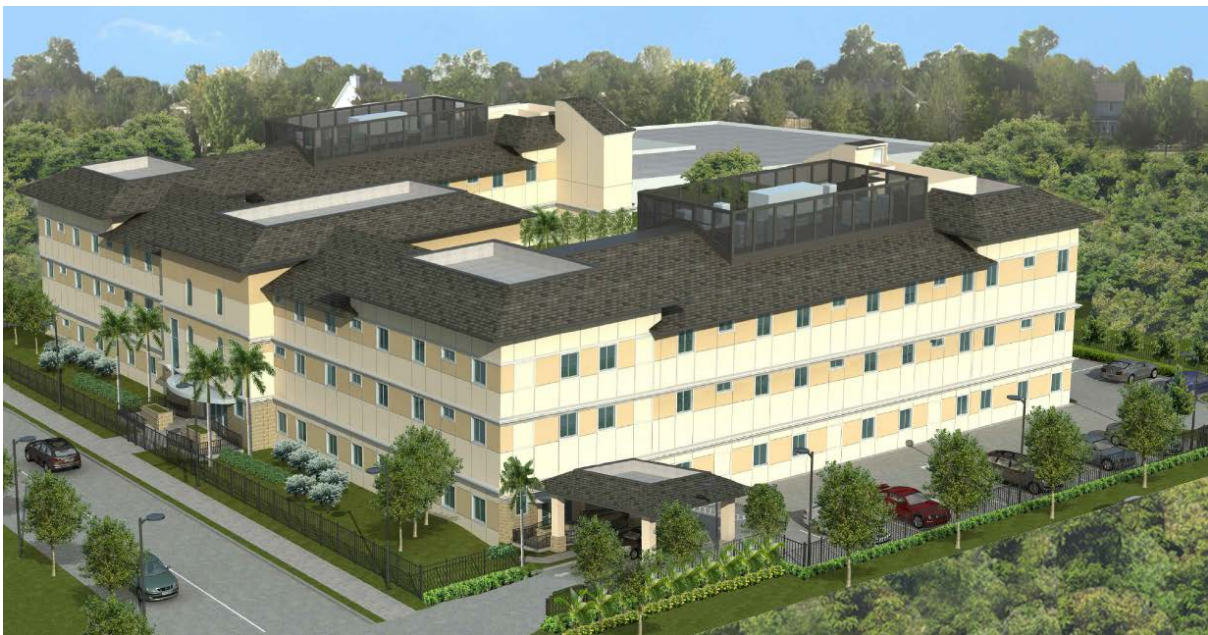
Above: Artist rendering of the completed medical rehabilitation facility at the 5000 Davie Green Reuse Site.

5000 Davie plans to address the contamination through a combination of strategies including contaminated soil removal, encapsulating contaminated soil beneath engineering controls that will be part of the future redevelopment, and creating institutional controls to prevent direct exposure to contaminated groundwater. The proposed redevelopment will consist of a new $6 million, 175-bed comprehensive medical rehabilitation facility and lush landscaping that will embrace the scenic corridor along Davie Road. Assessment and rehabilitation of the site is ongoing, and redevelopment is scheduled to begin following issuance of demolition permits for the existing structures at the site. Through the VCTC Program, $27,744 in corporate income tax credits were awarded for site rehabilitation work conducted in 2020.