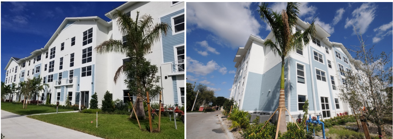
Above (left and right): the completed Saratoga Crossings Development

Contamination at the site consists of arsenic in soils and groundwater that is likely tied to the property's historical agricultural usage. On February 22, 2019, Broward County approved a Remedial Action Plan that included plans to excavate areas of arsenic-contaminated soil for reuse onsite to raise the elevation of building pads constructed for the apartment buildings. Remaining contaminated soils and groundwater will be addressed through engineering and institutional controls instituted by a recorded Declaration of Restrictive Covenant in pursuit of a Conditional Site Rehabilitation Completion Order. To date, redevelopment is complete with 100% of the units occupied. Through the VCTC Program, $33,915 in corporate income tax credit has been awarded to offset the costs of rehabilitation.