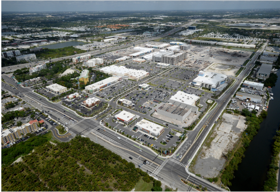
Aerial View of the Dania Pointe Brownfield Site under rehabilitation and redevelopment in April 2019 ( top , courtesy of Hoar Construction ) and an artist rendering of the finished Dania Pointe development ( below , courtesy of www.daniapointe.com )

During site assessment, arsenic and polynuclear aromatic hydrocarbons were identified above applicable CTLs on specific parcels within the site in soil and groundwater. On December 9, 2016, Broward County approved a Remedial Action Plan to perform source removal, soil management, and groundwater monitoring activities, which will be ongoing through 2020. Institutional and engineering controls will ultimately be utilized to seek a Conditional Site Rehabilitation Completion Order. Through the VCTC Program, over $1,123,000 in corporate income tax credits has been granted to date for assessment and cleanup work. For more information, see the Dania Pointe website at http://www.daniapointe.com/ .