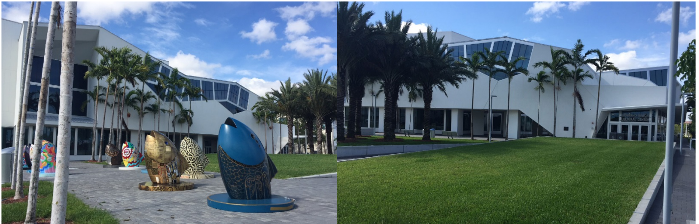
Above, left and right: The completed Civic Plaza Below: Completed interior of the library lobby