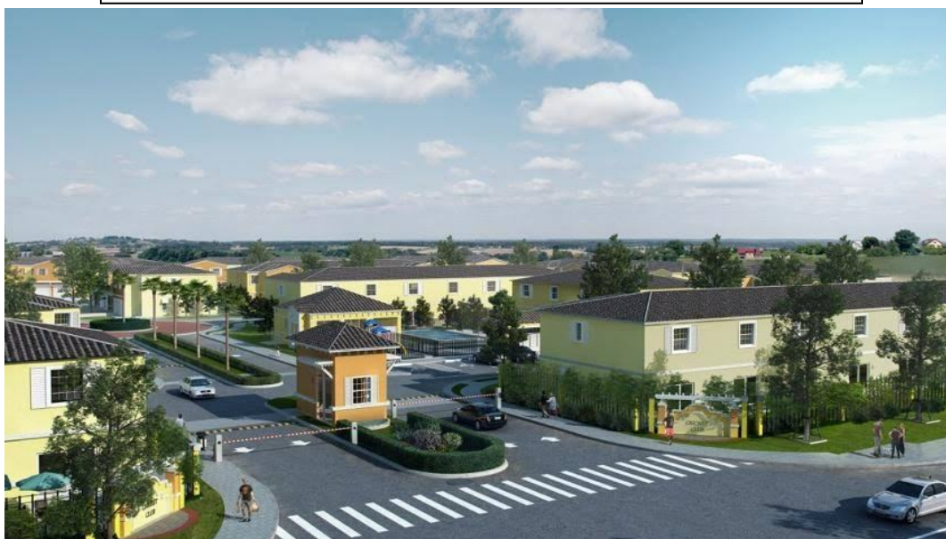
Above: Artist rendering of the Cricket Club ( Courtesy: DRHorton )