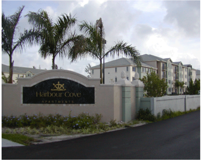
Above: Harbour Cove Apartments in Hallandale Beach.

After completing site assessment, a Monitoring Only Approval Order was issued to monitor the ammonia and petroleum-contaminated site groundwater in accordance with Chapter 62-785, Florida Administrative Code (Brownfield Rule in effect at the time). Upon completing the prescribed monitoring to establish Alternative Groundwater Cleanup Target Levels, Harbour Cove enacted an institutional control to prohibit groundwater use on the property. Soils contaminated with low concentrations of arsenic and polynuclear aromatic hydrocarbons have also been addressed through institutional and engineering controls. A Conditional SRCO was issued by Broward County on May 6, 2009.