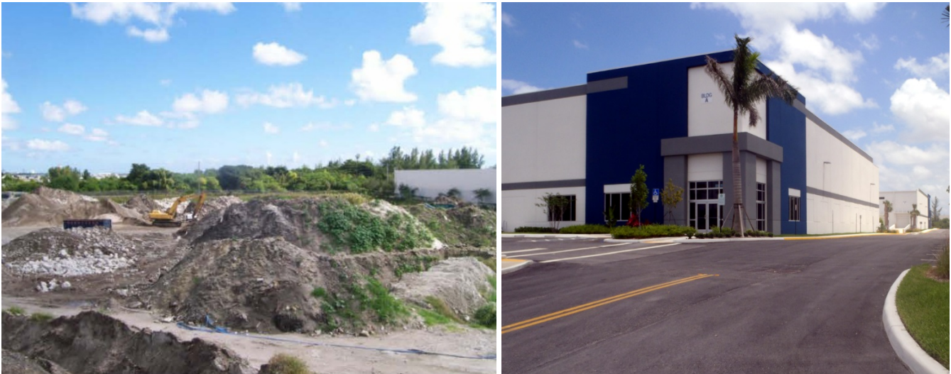
Above: The Dania Motocross Site in 2010 (left) and after rehabilitation and redevelopment in 2015 (right)

Prior to the time of BSRA execution, years of groundwater monitoring was performed at the facility under a Final Judgment entered on November 1, 1988, in the Circuit Court of the Seventeenth Judicial Circuit. The BSRA was executed to effectively utilize the risk-based corrective action techniques of the Brownfield Cleanup Criteria for lingering dissolved metals contamination (specifically consisting of manganese, iron, and aluminum) in groundwater.