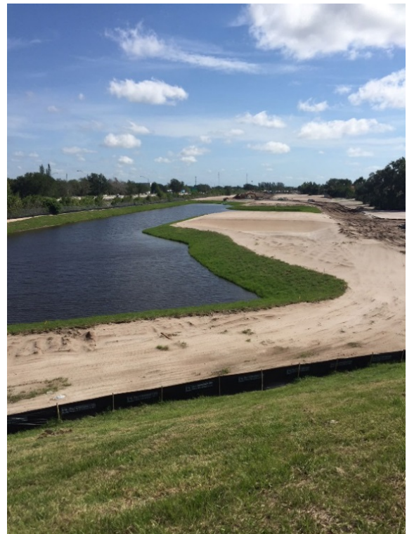
Above Left: Vantage at Palm Aire redevelopment plan Above Right: The western portion of Site, as seen in May 2018.