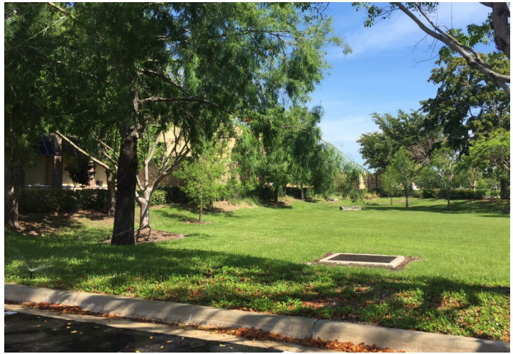
Above Left: The completed Wal-Mart store in Sunrise Above Right: Dry retention area at back of the store