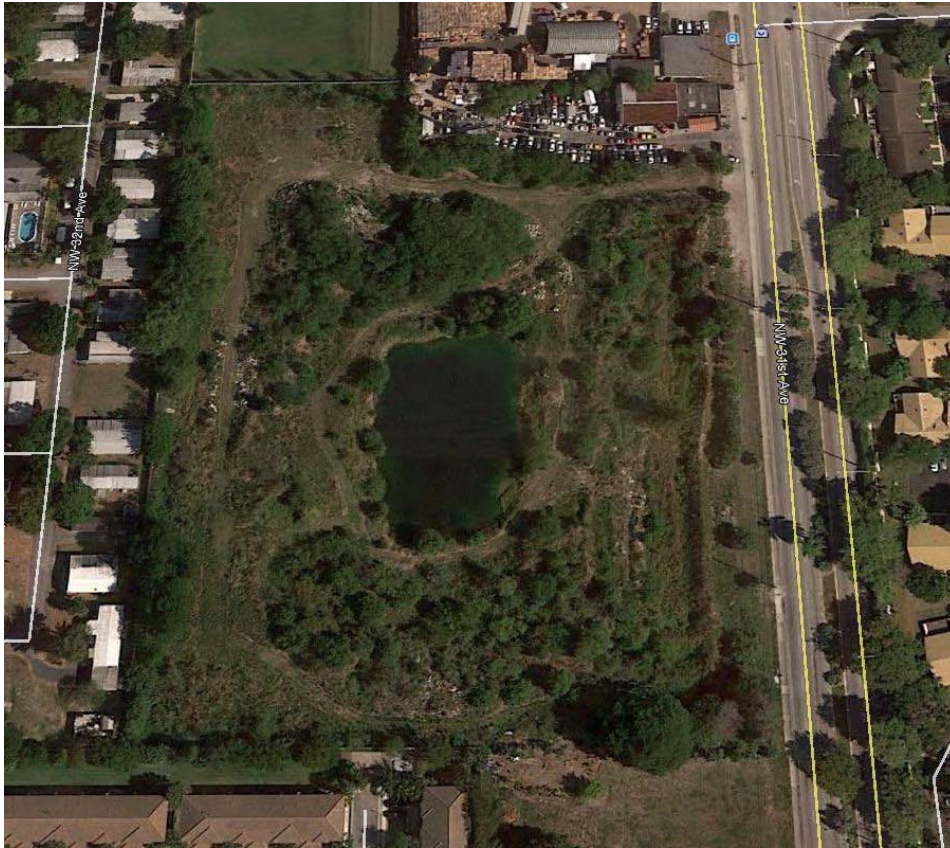
Above: The Oakland Parcel Green Reuse Site in Oakland Park

Throughout 2017 and 2018, rehabilitation tasks included source removal of impacted soils, the application of two (2) feet of clean fill throughout the property as an engineering control, and the monitoring of site groundwater. Ultimately institutional and engineering controls will be implemented through a Declaration of Restrictive Covenant.