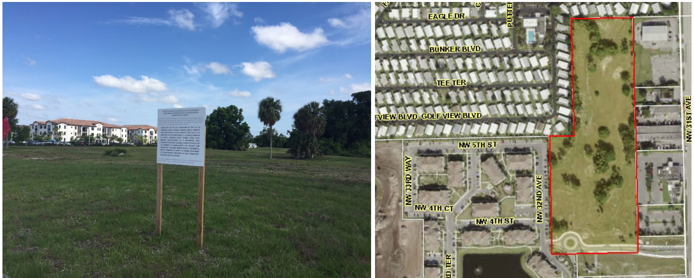
Above Left: The Pompano Beach Sports Park Reuse Site, with public notice displayed. The redeveloped West Atlantic Apartments Investors, LLC, Brownfield Site (BF061503001) is in the background. Above Right: Aerial View of the Pompano Beach Sports Park Reuse Site, outlined in red, also showing its location relative to the West Atlantic Blvd. Apartments Investors, LLC, Brownfield Site (BF061503001)

Through a competitive Request for Proposals process, the City of Pompano Beach has selected a developer for the site that will collaborate with the City to build a multi-use facility for professional soccer, neighborhood football, and other sports. The Floridian Pompano Beach Sports Park & Residences will include a soccer stadium, 14,000 square foot clubhouse, 8 soccer fields, 3 multi-sport fields, and 80 apartments. In addition to hosting professional club soccer, the facility will offer a wide array of youth development and mentoring programs focused on enabling community athletes to attain the skills levels necessary to be awarded college scholarships.