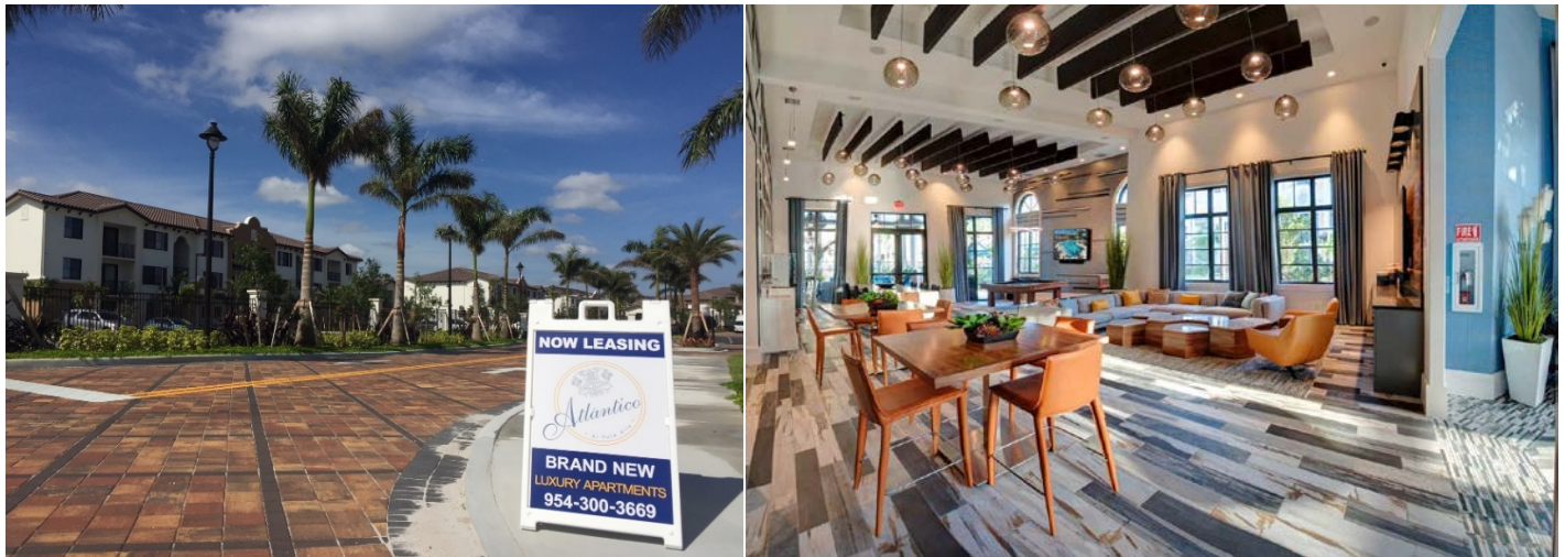
Above: Atlantico at Palm Aire

The City of Pompano Beach approved and permitted a 210-unit rental community for the site called Atlantico at Palm Aire, with a total capital cost estimated at about $34 million; it consists of 9 new three-story multi-family buildings, a club house, tot lot, dog park, and a bike path. As of the date of this report, site rehabilitation and construction of the complex are complete. A Declaration of Restrictive Covenant has been recorded to enact a groundwater use restriction and the maintenance of engineering controls, and a Conditional Site Rehabilitation Completion Order was issued on September 20, 2018. Through the VCTC Program, FCI Development Ten LLC, received over $785,000 in corporate income tax credits for assessment and cleanup work.