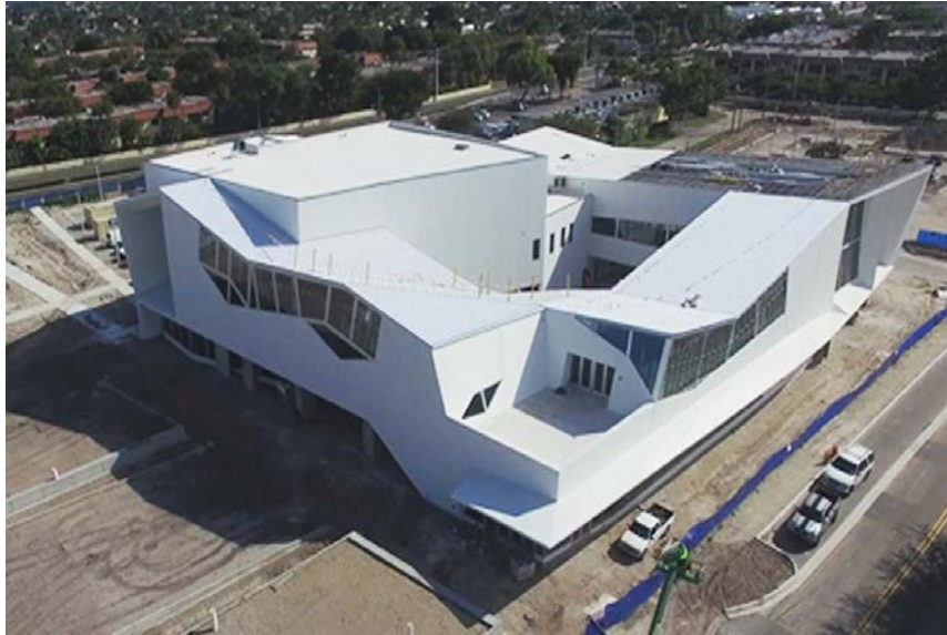
Above: The Pompano Replacement Library and Civic Campus under construction.