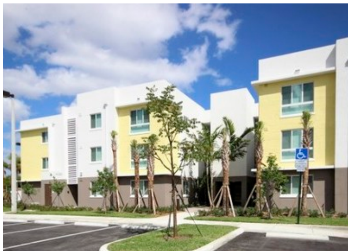
Above: Urban gardens and similar construction to the Northwest Gardens V Site in Fort Lauderdale