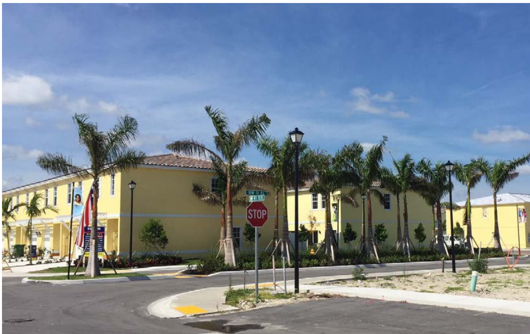
Above: Photo of Cricket Club under development, May 2018

MAS Development began site grading and earth-moving work in March 2017 and has finished the construction of 155 townhomes. Known as Cricket Club, the three-bedroom homes begin at 1,446 square feet of living space; prices start in the upper-$200,000s. The community has a clubhouse, playground, pool, and greenspace.