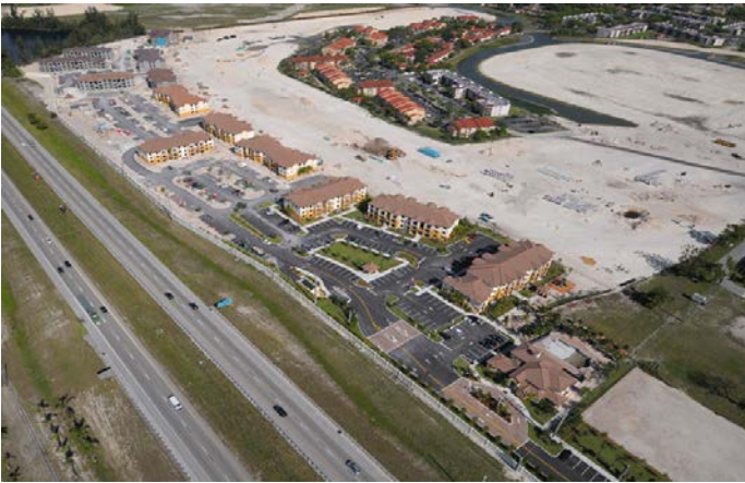
Above: Sorrento at Miramar (foreground) under construction on the ZF Brownfield Site (taken April 2012)

Prior to execution of the BSRA, site assessment had been conducted on the entire former Foxcroft Golf Course to determine the magnitude and extent of arsenic contamination in soil and groundwater pursuant to Chapter 62-780, Florida Administrative Code. The arsenic contamination stemmed from the application of herbicides on the former golf course. Groundwater contamination throughout the golf course was monitored for a period of one (1) year, and Broward County also approved a soil management strategy as a Remedial Action Plan.