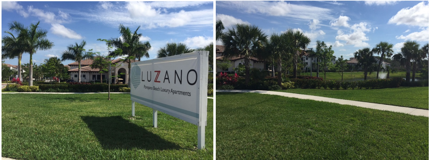
Above: Luzano, the completed 414-unit luxury apartment complex.

The BSRA for the West Atlantic Boulevard Apartment Investors site in Pompano Beach was executed December 18, 2015, with West Atlantic Boulevard Apartment Investors, LLC. The site (also known as Residences at Palm Aire) is generally located at the northeast corner of the Turnpike and Atlantic Boulevard in Pompano Beach and was purchased by West Atlantic Boulevard Apartment Investors, LLC, in 2015. The site is also known as Phase 1 of the overall former Palm Aire Golf Course redevelopment project.