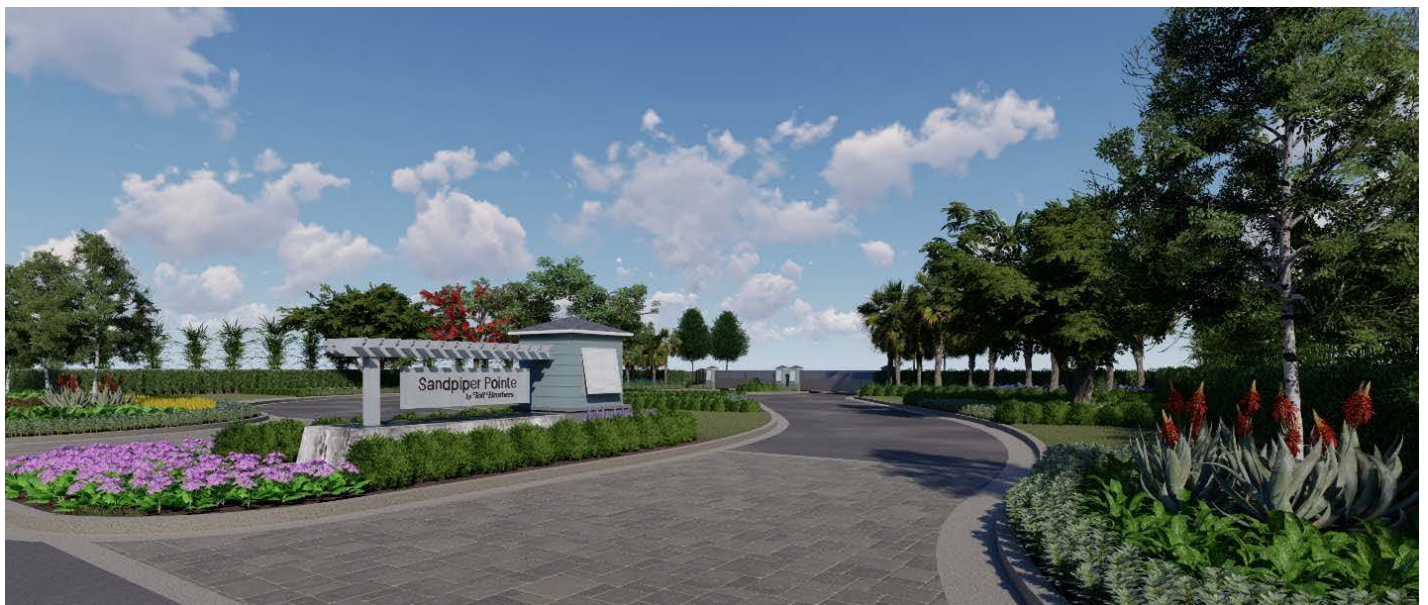
Above: Draft Conceptual Site Plan and Entrance Renderings for the proposed Sandpiper Pointe residential development.

The Former Hillsboro Pines Golf Club Brownfield Site has documented soil and groundwater arsenic impacts that occurred during its former operation as a golf course which historically applied agricultural chemicals in accordance with label directions. Detected arsenic concentrations compared favorably with detected arsenic concentrations in similar circumstances at other golf courses in South Florida. On March, 2019, a Soil Management RAP was approved by Broward County. As of the date of this report, site rehabilitation and redevelopment are ongoing. Groundwater impacts will be addressed with on and offsite institutional controls. The site will be closed with no soil restrictions for the recreational parcels. A Soil Management Plan and engineering controls will be used to address soils for the residential parcel. Through the VCTC Program, over $130,000 in corporate income tax credits has been granted to date for assessment and cleanup work.