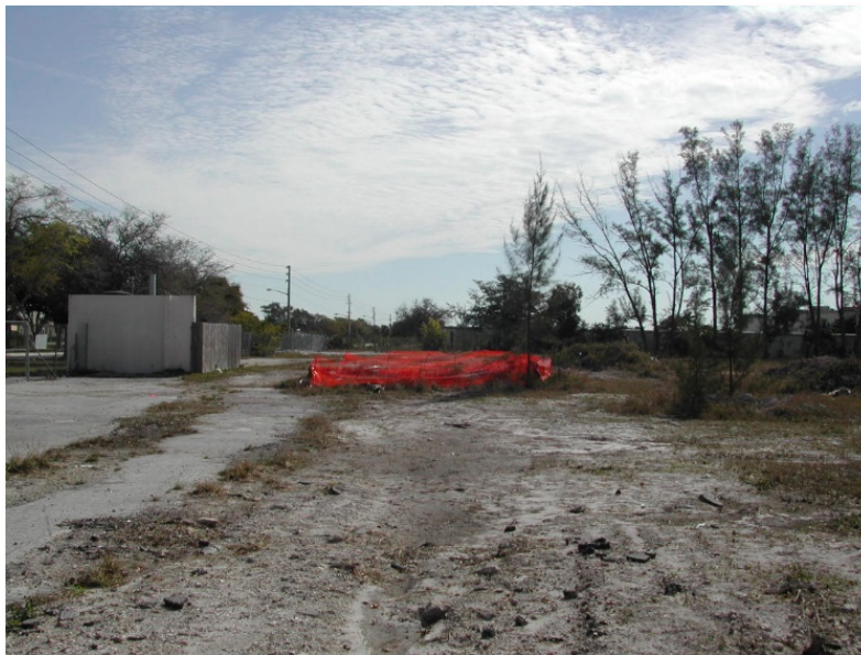
Above: The Pan American Brownfield Site in Coral Springs. The compound for the pump-and-treat remediation system is seen on the left.

The BSRA for the Pan American Brownfield site, which spans three (3) parcels at 12400, 12404, and 12408 NW 35 th Street in Coral Springs, was executed December 9, 2015. The Brownfield Area designation and BSRA are key to catalyzing reuse planning by the developer and its investors and lenders. While still in the conceptual design phase, redevelopment is focused on businesses that generate major job creation and leverage the site’s proximity to over 1 million square feet of industrial warehouse space, one of the region’s largest expressways, and a rapidly expanding employer base. Uses that are being explored for this site include community banks, neighborhood retail, a business traveler’s hotel, grocers with fresh produce, and pharmacies.