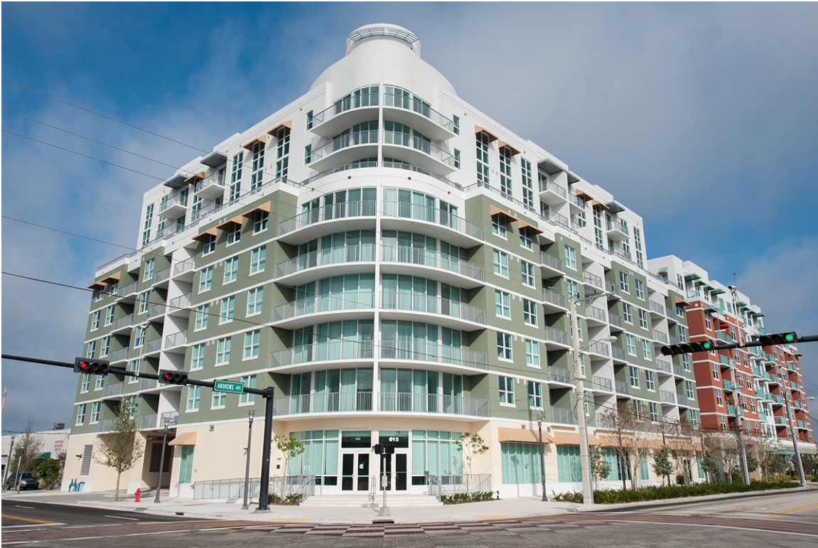
Above: Wisdom Village Crossing ( courtesy Turnstone Development )

Originally a warehouse and storage yard, arsenic was identified in site soils and groundwater above applicable cleanup target levels. After conducting a source removal of the impacted soils and performing over a year of groundwater monitoring, a No Further Action with Conditions Proposal has been approved, and a Declaration of Restrictive Covenant has been drafted to enact groundwater use restrictions on the property. Through the VCTC Program, $29,680.83 in corporate tax income credit associated with site cleanup work has been granted.