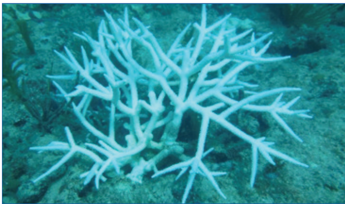
Completely bleached coral.

Coral bleaching is a stress reaction of the coral animals that happens when they expel their symbiotic algae, zooxanthellae, which is their main food and energy source. Bleached corals are living but are less likely to reproduce and are more susceptible to disease, predation and mortality. If stressful conditions subside soon enough, the corals can survive the bleaching event; however, if stresses are severe or persist, bleaching can lead to coral death.