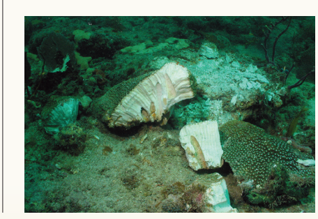
Shattered great star coral (Montastraea cavernosa), resulting from a vessel impact.