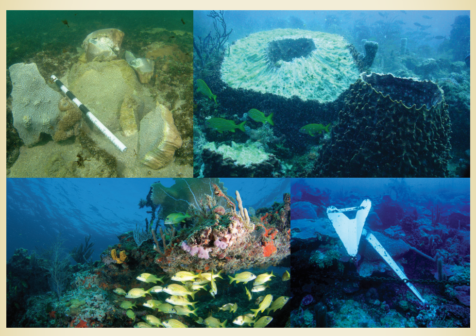
Vessel grounding and anchoring impacts (clockwise from top left): broken knobby brain coral (Diploria clivosa), severed giant barrel sponge (Xestospongia muta), an abandoned anchor on the reef, and a healthy southeast Florida coral reef.

WWW.DEP.STATE.FL.US/COASTAL/PROGRAMS/CORAL/ AND WWW.DEP.STATE.FL.US/COASTAL/PROGRAMS/CORAL/RIPR.HTM