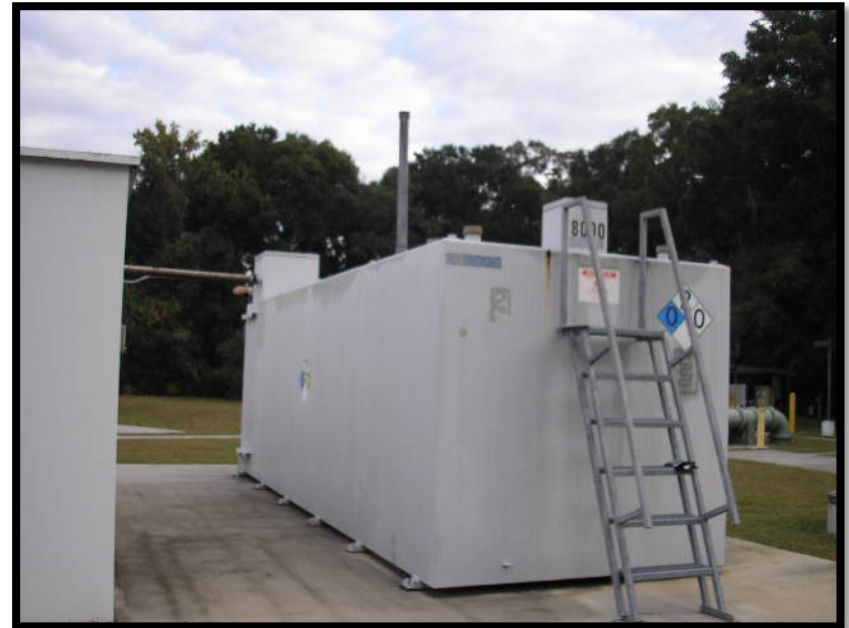
Chapter 62-762, F.A.C.* - AST Rule