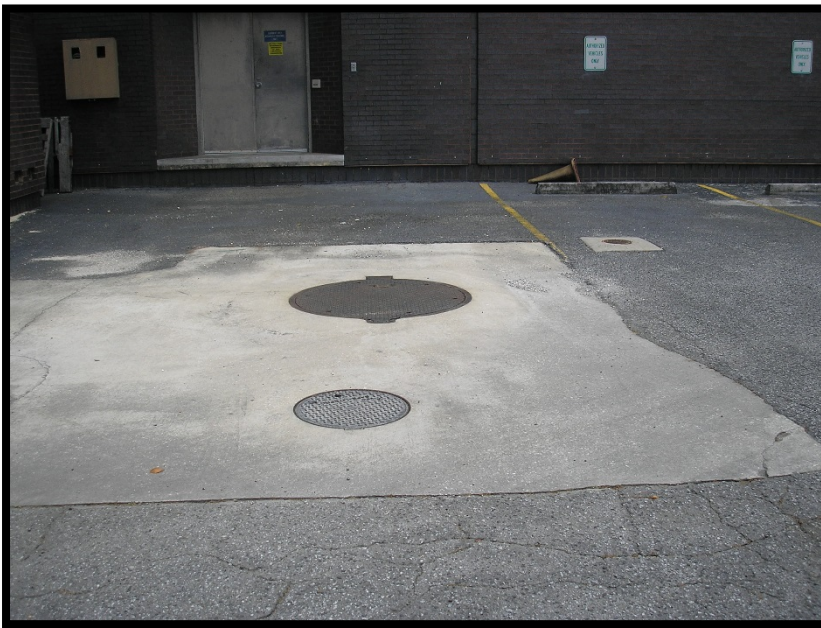
Chapter 62-761, F.A.C.* - UST Rule

Aboveground Storage Tanks (ASTs) > 550 gallons