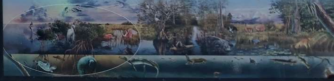
Signage at Outdoor Resorts in Chokoloskee