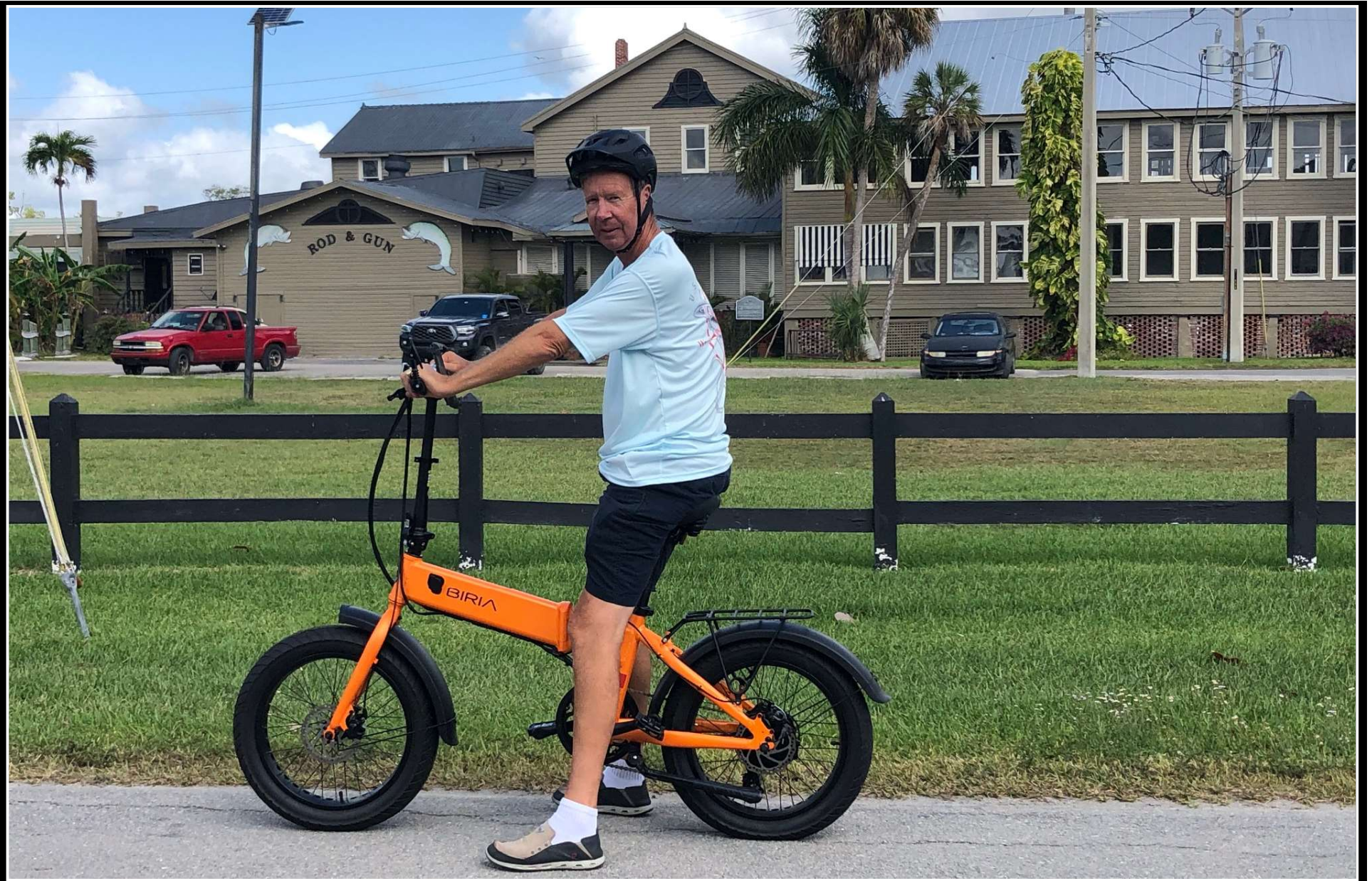
Local Resident touring around town on electric bike