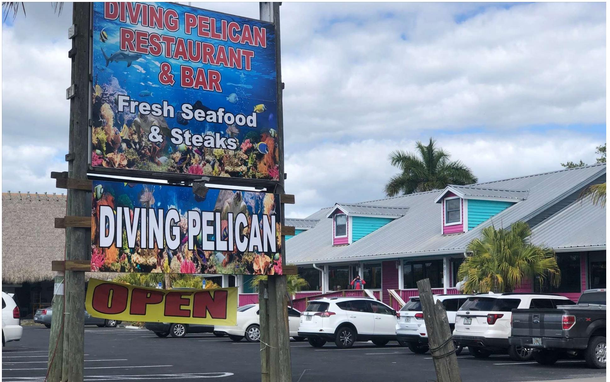
Diving Pelican – Rebuilt Restaurant & Bar along Causeway to Chokoloskee