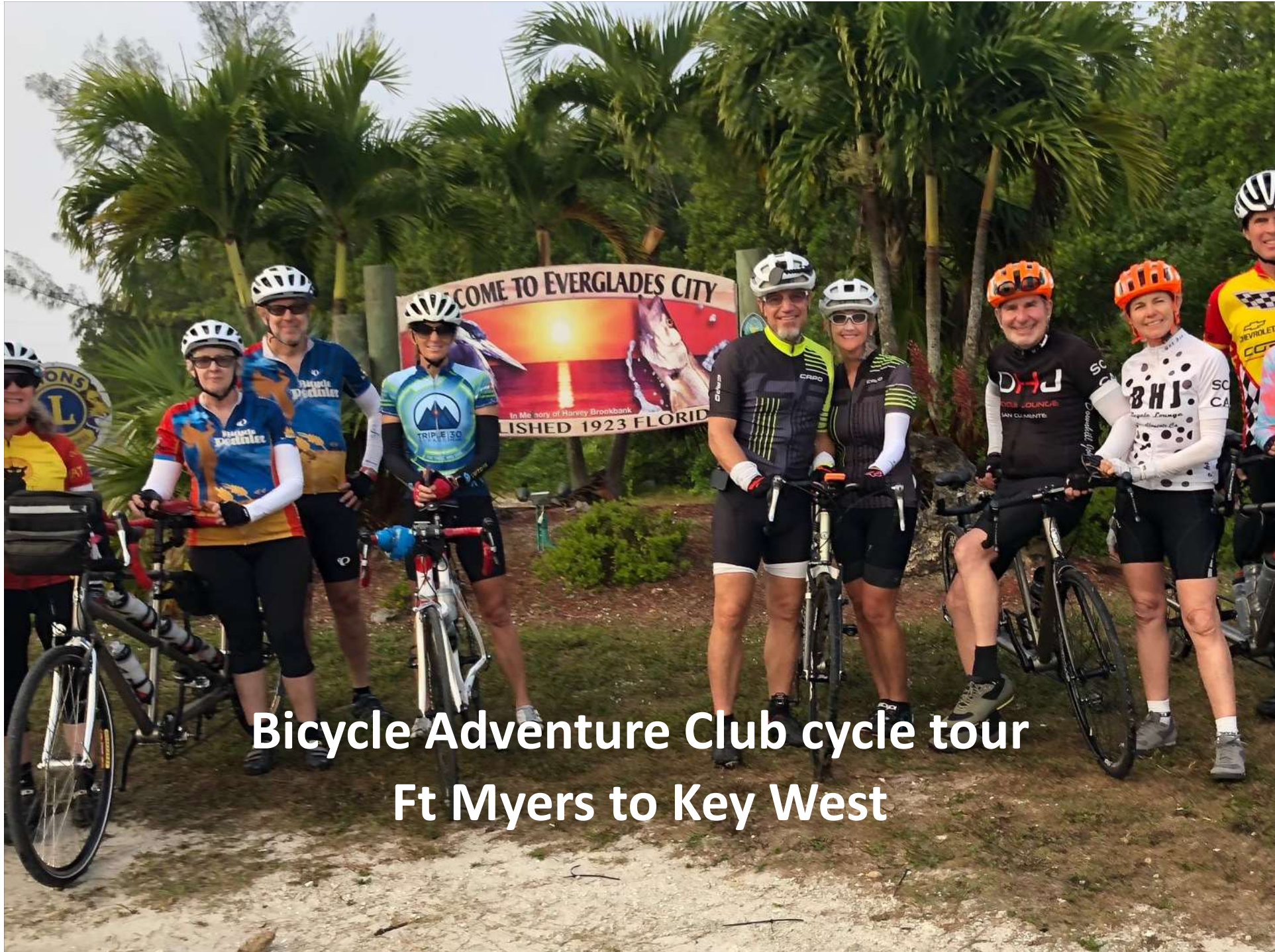
Bicycle Adventure Club cycle tour Ft Myers to Key West