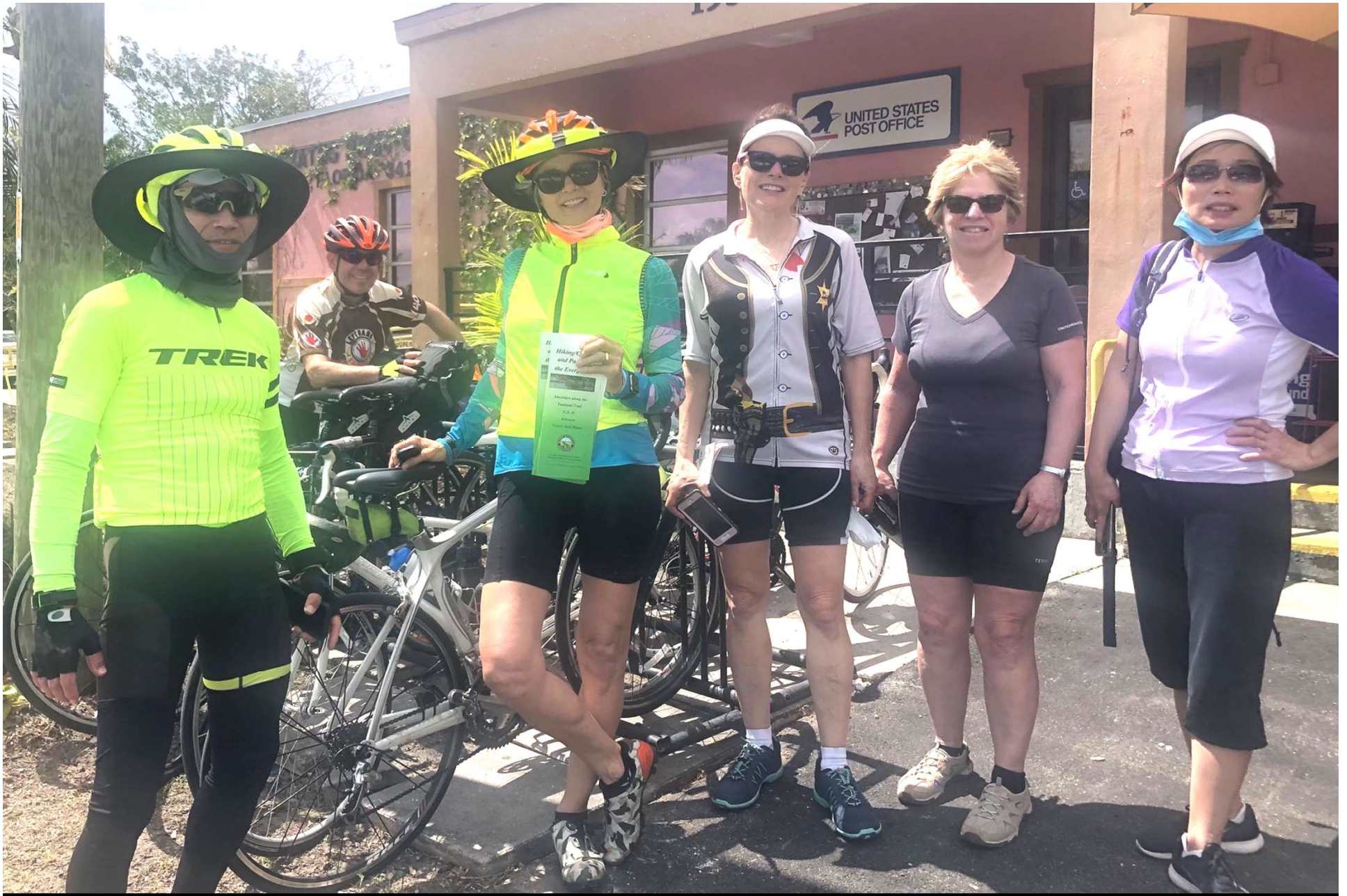
Tour of Miami – Key West – Marco Island – Everglades