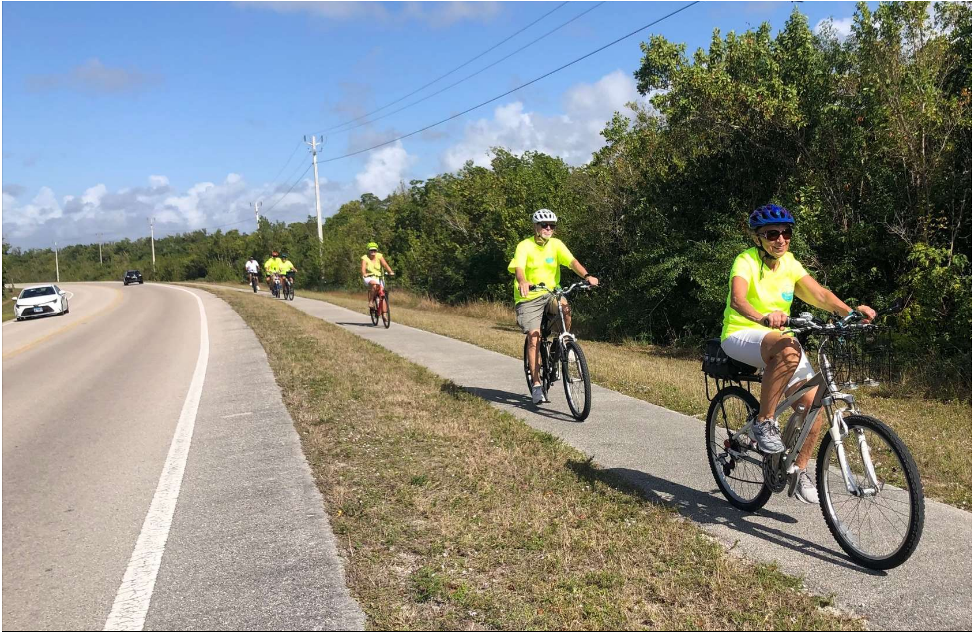
Homeowners group visiting from Naples