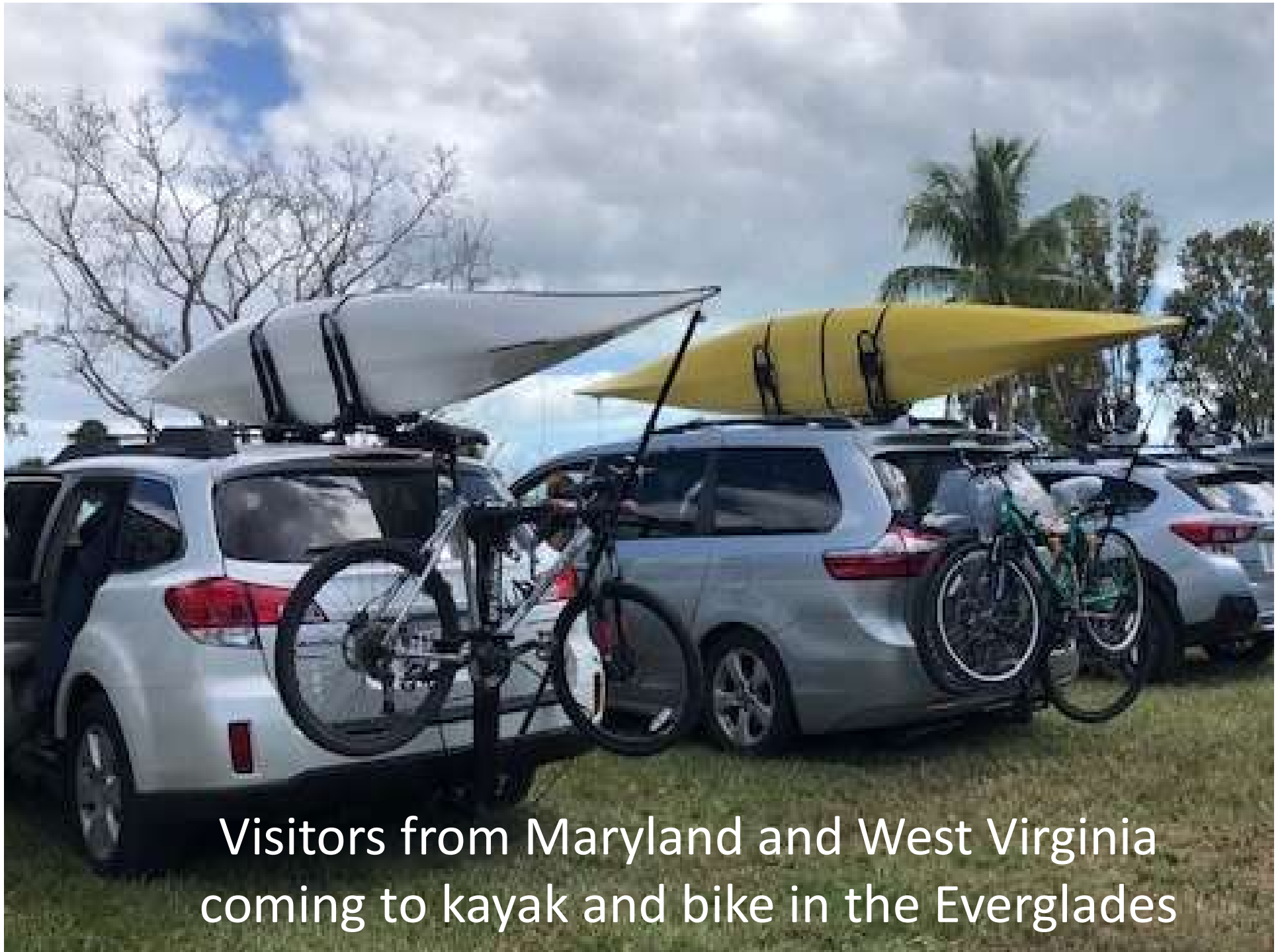
Visitors from Maryland and West Virginia coming to kayak and bike in the Everglades