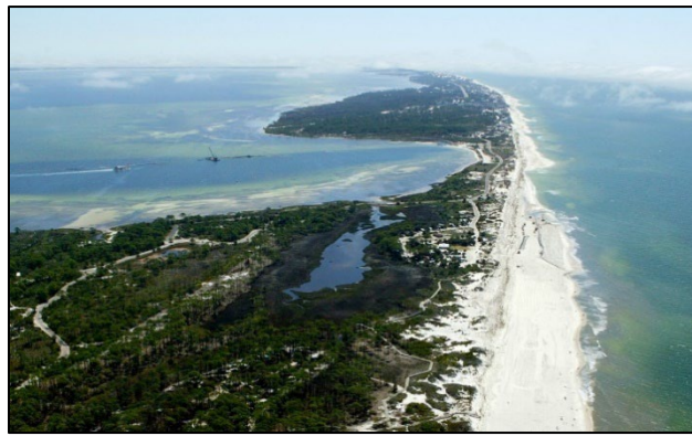
St. Joseph Peninsula Nourishment Project Gulf County - 2019

Beach management projects require time to plan, design, finance, construct, monitor, and maintain. The Budget Plan provides a statewide view of the many individual project efforts. It is used to encourage cooperation and coordination among the local, state, and federal entities and organizations involved in managing Florida beaches. The first year of the Budget Plan summarizes DEP's LGFR submitted to the Florida Legislature for funding consideration in FY 2024/2025. The second and third years (FY 2025/2026 and FY 2026/2027, respectively) list the beach and inlet management projects prioritized in rank order based on funding eligibility and criteria in Chapter 62B-36, Florida Administrative Code, and overall readiness to proceed. Lastly, years four and five (FY 2027/2028 and FY 2028/2029, respectively) list the projects by region and provide the estimated costs of the planned phase. Funding estimates for FY 2025/2026 and beyond are subject to revision by the local sponsor and revalidation by DEP to reflect changes in project scope, cost estimates, project eligibility, and availability of state, local, and federal funds.