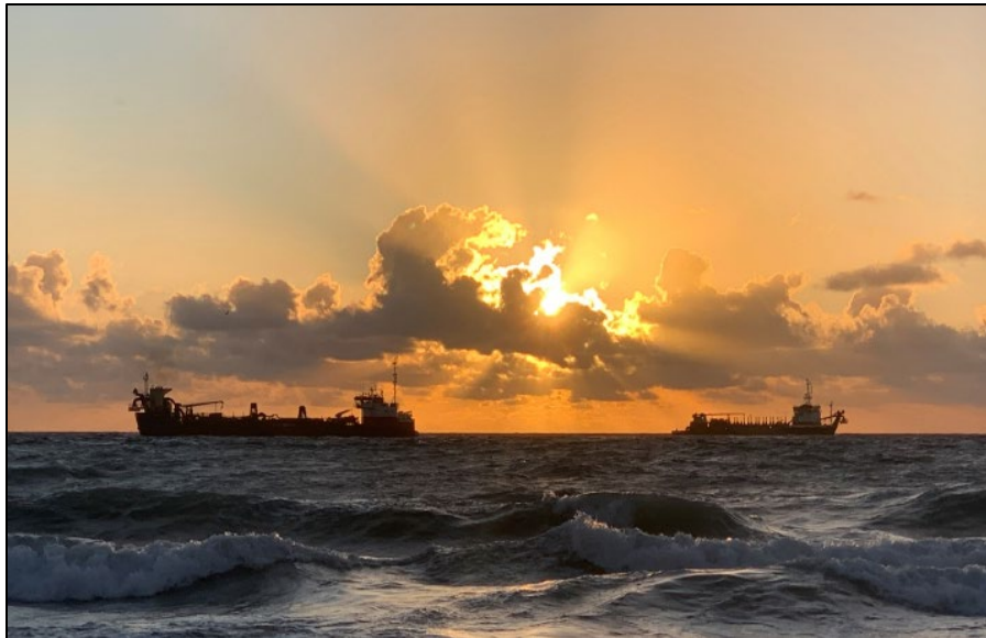
Mid-Town Beach Nourishment Project Town of Palm Beach – 2020

The Budget Plan projects the 5-year planning needs for federal, state, and local governments necessary to implement the Strategic Plan. The information contained within is based primarily upon formal projections for funding furnished to DEP from local sponsors. Federal costs have been estimated for planning purposes and are not verified by the Corps. Where information has not been provided by local sponsors, project cost estimates have been projected by DEP for planning purposes. The Budget Plan is divided into the same regions as the Strategic Plan. A map of the regions is presented on Page 4.