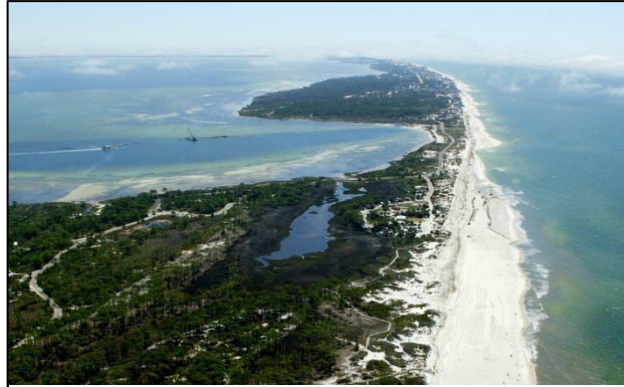
St. Joseph Peninsula Nourishment Project Gulf County – 2019

Beach management projects require time to plan, design, finance, construct, monitor, and maintain. The Budget Plan provides a statewide view of the many individual project efforts. It is used to encourage cooperation and coordination among the local, state, and federal entities and organizations involved in managing Florida beaches. The first year of the Budget Plan summarizes DEP’s LGFR submitted to the Florida Legislature for funding consideration in FY 2023/2024. The second and third years (FY 2024/2025 and FY 2025/2026, respectively) list the beach and inlet management projects prioritized in rank order based on funding eligibility and criteria in Chapter 62B-36, Florida Administrative Code, and overall readiness to proceed. Lastly, years four and five (FY 2026/2027 and FY 2027/2028, respectively) list the projects by region and provide the estimated costs of the planned phase. Funding estimates for FY 2024/2025 and beyond are subject to revision by the local sponsor and revalidation by DEP to reflect changes in project scope, cost estimates, project eligibility, and availability of state, local, and federal funds.