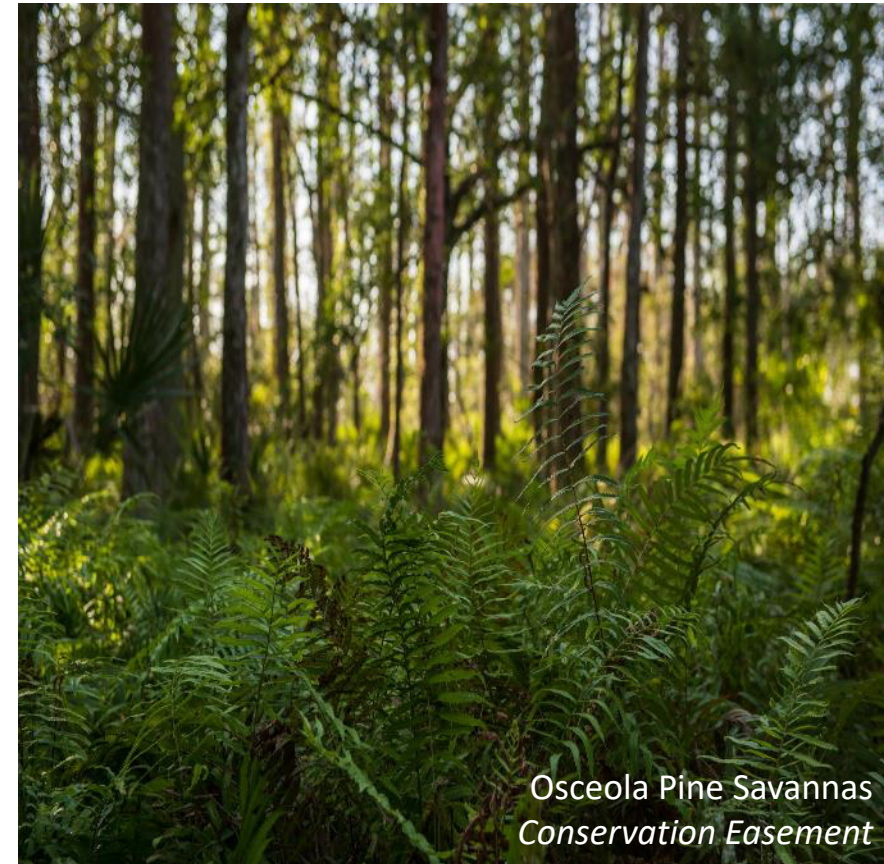
Osceola Pine Savannas Conservation Easement