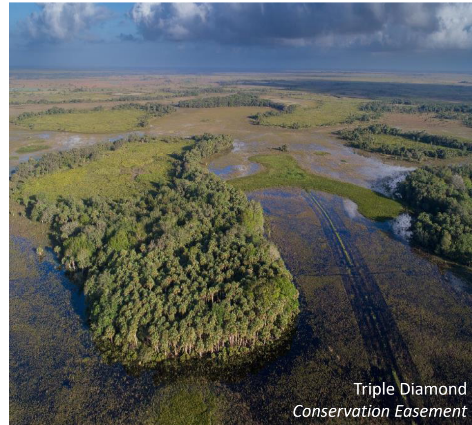
Triple Diamond Conservation Easement