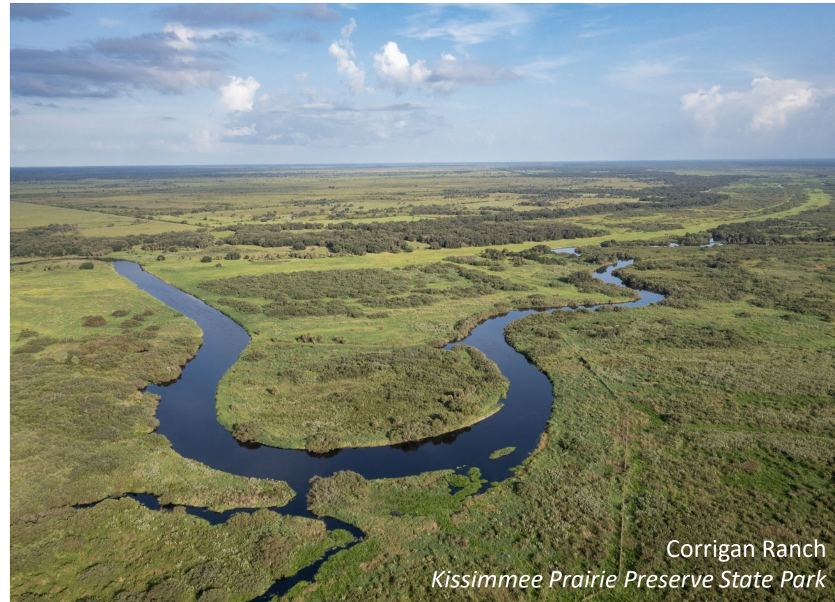
Corrigan Ranch Kissimmee Prairie Preserve State Park