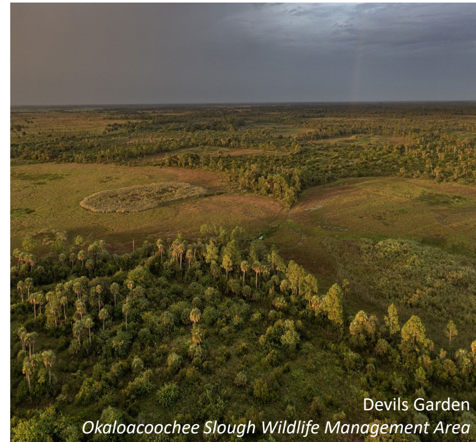
Devils Garden Okaloacoochee Slough Wildlife Management Area