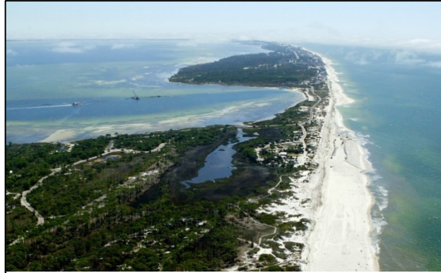
St. Joseph Peninsula Nourishment Project Gulf County – 2019

Beach management projects require time to plan, design, finance, construct, monitor, and maintain. The Budget Plan provides a statewide view of the many individual project efforts. It is used to encourage cooperation and coordination among the local, state, and federal entities and organizations involved in managing Florida beaches. The first year of the Budget Plan summarizes DEP’s LGFR submitted to the Florida Legislature for funding consideration in FY 2022/2023. The second and third years (FY 2023/2024 and FY 2024/2025, respectively) list the beach and inlet management projects prioritized in rank order based on funding eligibility and criteria in Chapter 62B-36, Florida Administrative Code, and overall readiness to proceed. Lastly, years four and five (FY 2025/2026 and FY 2026/2027, respectively) list the projects by region and provide the estimated costs of the planned phase. Funding estimates for FY 2023/2024 and beyond are subject to revision by the local sponsor and revalidation by DEP to reflect changes in project scope, cost estimates, project eligibility, and availability of state, local, and federal funds.