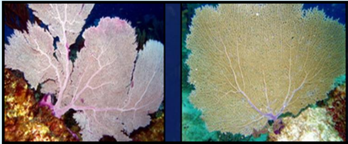
Common Sea Fan Gorgonia ventalina

FL Marine Life Rule - No Harvest w/o Special Activity License (FAC 68B-42.009)