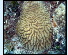
Maze Coral Meandrina meandrites