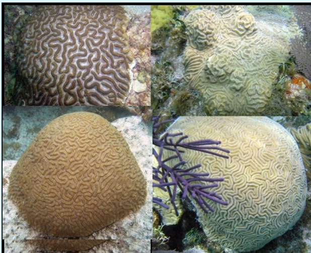
Brain corals: approx. 5 species in the area, ID by shape and size of ridges, or knobs. 3 species are in the genus Diploria