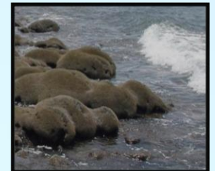
Worm Rock - not a coral Phragmatapoma lapidosa