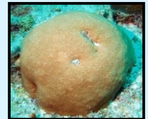
Massive Starlet Coral Siderastrea siderea