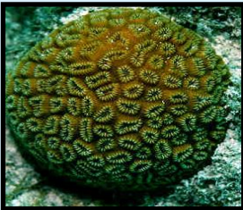
Elliptical Star Coral Dichocoenia stokesii