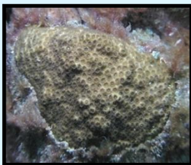
Smooth Star Coral Solenastrea bournoni