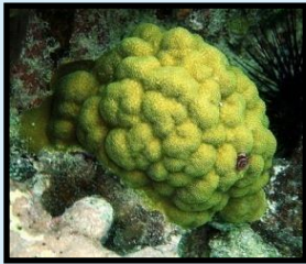
Mustard Hill Coral Porites asteroides

3 coral species are protected under either Federal ESA or FL Statute: see other side.