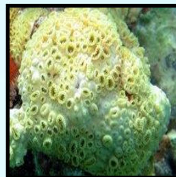
↑ Colonial Zoanthid ( Palythoa sp.) - not a coral