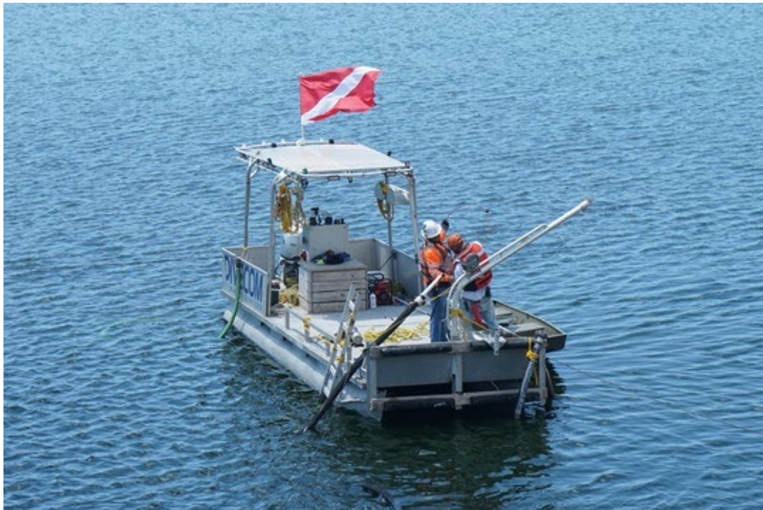
Dive teams assess repair efforts using submerged technology.

Residents can find the latest information on the status of the site and response activities at ProtectingFloridaTogether.gov/PineyPointUpdate .