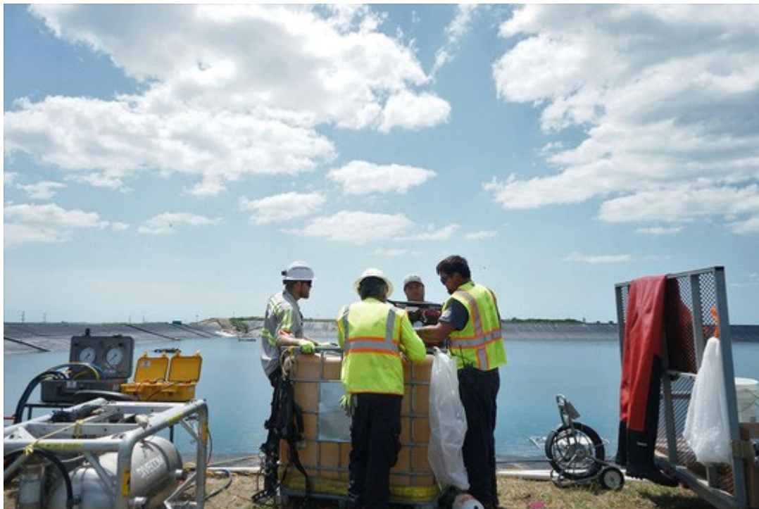
Dive teams preparing to further assess repair efforts underwater.

Residents can find the latest information on the status of the site and response activities at ProtectingFloridaTogether.gov/PineyPointUpdate .