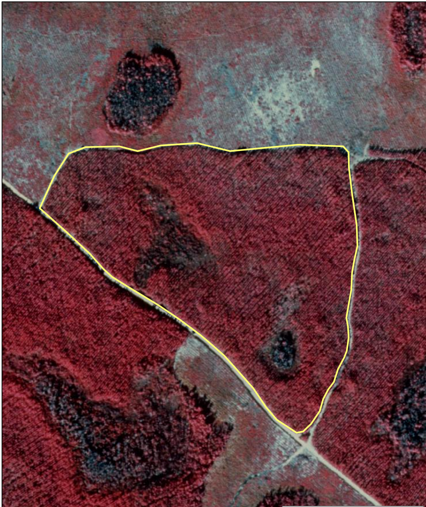
Figure 10-1 Salamander Triangle Conservation Unit