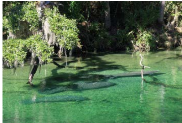
Blue Springs State Park

https://floridadep.gov/water/water-compliance-assurance/content/emergency-response