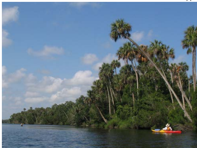
Lower Tomoka, FWC