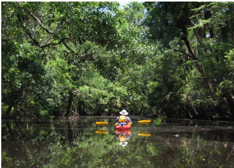
Upper end of Tomoka, FWC

Tomoka State Park is a site on the Great Florida Birding and Wildlife Trail , and a bird-watcher's paradise, especially during the spring and fall migrations. The park protects a variety of wildlife habitats and endangered species, such as the West Indian manatee. Visitors can stroll a half mile nature trail through a hardwood hammock that was once an indigo field for an 18th century British landowner. Native Americans once dwelled here, living off fish-filled lagoons. The high ground now occupied by the state park was once the site of the Timucuan Native American village of Nocoroco. This site is commemorated by an interesting sculpture of Chief Tomokie, built in the 1950s portraying the story of a poem about a mythical princess known as "Oleta". In the late 1700s the area was part of a 22,000-acre rice and indigo plantation. Tomoka State Park with its sister park Bulow Creek make up over 8 miles of the scenic drive known as the Ormond Scenic Loop . A boat ramp gives access to the Halifax River (Intracoastal Waterway) and Tomoka River. Canoe and kayak rentals are available. For overnight stays, the park has full-facility campsites and youth camping.