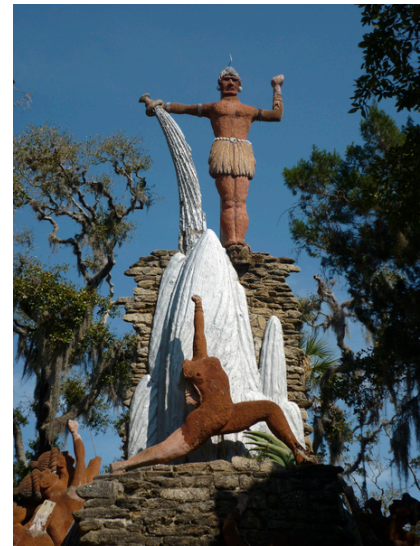
Chief Tomokie statue