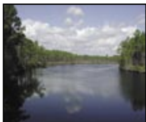
New River in Tate's Hell State Forest

Where the Gulf breezes whisper through the tall pines along the shoreline between Carrabelle and Apalachicola, Tate's Hell State Forest provides an introduction to the coastal pine forests that front the Gulf of Mexico. High Bluffs Coastal Nature Trail loops through dunes covered with scrub plants like Florida rosemary and scrub mint under a canopy of sand pines, and passes within sight of cypress domes. Access the trailhead from US 98 just west of Carrabelle Beach.