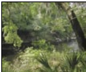
Suwannee River State Park

Suwannee River State Park, west of Live Oak off US 90, has a hiking trail for everyone. The Earthworks Trail leads through defensive earthworks built during the Civil War, and the Sandhills Trail passes through the cemetery of the ghost town of Columbus. The Suwannee River Trail System has several options to enjoy scenic views along the river and its cypress-lined tributary. Backpackers can head out on the Big Oak Trail , which passes a side trail to the historic ruins of a former governor's plantation before it connects with the Florida Trail to lead you to a deeply forested peninsula. The Park is a gateway to outdoor recreation on the Suwannee River Wilderness Trail (SRWT). For more information on SRWT, visit www.floridastateparks.org/wilderness or call (800) 868-9914.