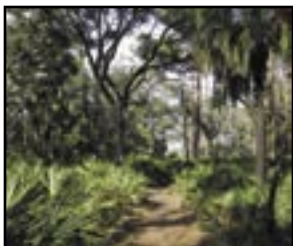
Lake Kissimmee State Park

In one of Florida's best parks for wildlife watching, stretch your legs on four different trails, just west of Winter Haven. The interpretive Flatwoods Pond Nature Trail illustrates habitat succession, while the Buster Island Trail and North Loop Trail enjoy a shady canopy of ancient live oaks for most of their loop, and provide primitive campsites for backpackers. The Gobbler Ridge Trail is a spur through open scrub and prairie to the marshy fringe of Lake Kissimmee.