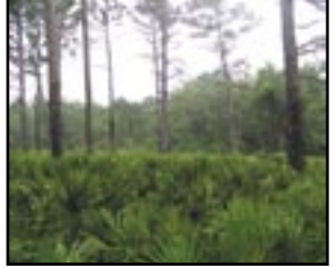
Wekiwa Springs State Park

Surrounding one of Florida's beautiful first magnitude springs just north of Orlando, the hiking trails of Wekiwa Springs State Park offer options for everyone. The gentle Wet to Dry Trail boardwalk slips through the river swamp along the spring to meet the Wekiwa Springs Hiking Trail in the sandhills. The linear White Trail leads to the main wilderness loop where a backpacker's campsite, Camp Cozy, nestles under the cabbage palms along Rock Springs Run.