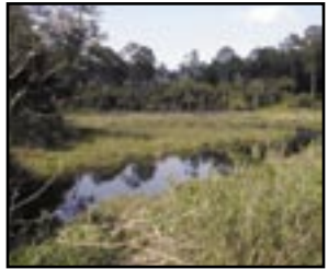
Bulow Creek Wetlands

Following the winding course of Bulow Creek, this trail connects two sites important to Florida's history. At Bulow Plantation Ruins Historic State Park, explore the ruins of an 1831 sugar mill on the Sugar Mill Trail . The Bulow Creek Hiking Trail runs south from the park and provides a day-hike loop option, the Bulow Creek Loop , through old growth forest. If you continue south into Bulow Creek State Park past Boardman Pond, a side trail leads to a backpacker's campsite, and the main trail ends at the Fairchild Oak, a gargantuan tree thought to be 2,000 years old or more, where the Wahlin Trail loops around a spring. Both parks are off I-95 between Flagler Beach and Ormond Beach.