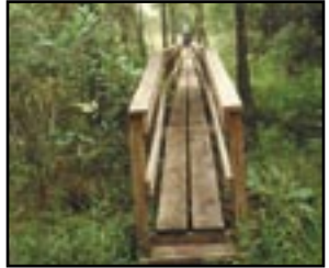
Little-Big Econ State Forest

Named one of the nation's top family-friendly trails by the American Hiking Society, a linear section of the Florida Trail along the Econlockhatchee River east of Orlando provides scenic views from the shade of palm hammocks on the bluffs high above this tributary of the St. Johns River, crossing numerous bridges over steep ravines. Trailheads are at Barr Street (SR 426) in Oviedo and Snowhill Road in Chuluota.