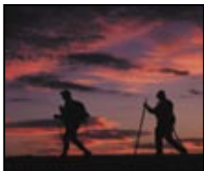
Sunrise along the Florida Trail

Lake Okeechobee Scenic Trail offers trailhead access points for day hiking from nearby parks.