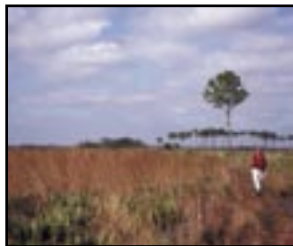
Myakka Hiking Trail

which culminates in a swinging bridge suspended 40 feet up in the oak canopy, and the Bird Walk , a boardwalk for wildlife watching along Little Myakka Lake.