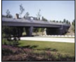
Land Bridge over I-75

This mile-wide corridor across Central Florida was once meant to be a barge canal expediting shipping across the peninsula. Instead, it's been preserved for recreational enjoyment and wildlife habitat where a linear section of the Florida Trail south of Ocala traverses sandhills, pine flatwoods, and steep forested slopes created by the canal building project in the 1930s. The trail offers