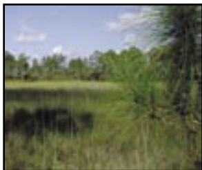
Fakahatchee Strand Preserve State Park

Along the Tamiami Trail east of Naples, the Big Cypress Bend Boardwalk * introduces you to some of the most ancient cypresses you'll ever see, where American bald eagles nest in their canopy above the Fakahatchee Strand. The boardwalk ends at a broad pond within the strand and you must backtrack to the trailhead. Renowned for its diversity of bromeliads and orchids, Fakahatchee Strand Preserve State Park also offers walks on old tramways * leading from Janes Scenic Drive, with guided hikes during the peak of orchid blooms each summer.