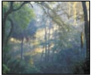
Ocala National Forest

First blazed in 1966, this segment of the Florida Trail is also its most popular, leading backpackers on a weeklong journey through the world's largest scrub habitat, from Clearwater Lake Recreation Area north of Eustis to the Buckman Lock south of Palatka. Several trailheads provide day hikers access to spectacular spots, including the Juniper Prairie Wilderness off SR 40 east of Ocala. A popular loop along the Florida Trail, the Yearling Trail , commemorates the setting of the Marjorie Kinnan Rawlings novel and can be reached from SR 19 south of Salt Springs.