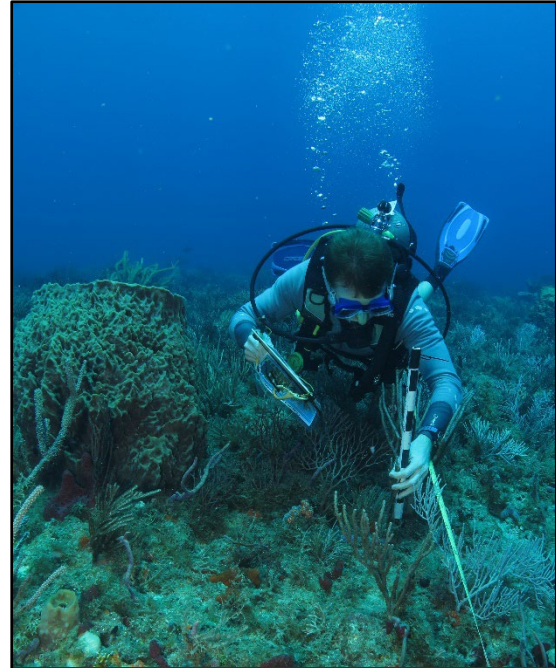
SECREMP diver measuring octocorals

Prior to the 2018 sampling year, Southeast Florida Coral Reef Ecosystem Conservation Area experienced significant stony coral community declines largely due to an unprecedented stony coral disease event. In 2018, further significant losses were recorded in stony coral cover and live tissue area (LTA), a metric used to estimate amount of coral tissue. Region-wide LTA was significantly lower starting in 2016 with no significant recovery through 2018; there was a significant 40% loss in LTA from 2015 to 2018. During the same time period, the region suffered a 57% loss in stony coral cover. This disease event was very likely the greatest contributing factor to the significant loss of stony coral colonies and LTA identified within the SECREMP sites. Conditions appear to be improving with a decrease disease prevalence in 2018, and the recording of many juvenile stony corals of the species affected by disease in the SECREMP sites. Additionally, it is positive to note that neither the octocoral nor barrel sponge communities appear to have been impacted by the disease event.