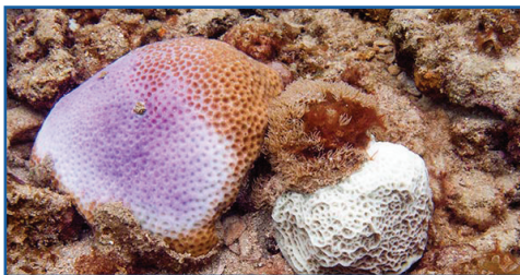
(L-R): Massive Starlet coral (Siderastrea siderea) displaying a typical blue bleaching color and bleached Lettuce coral (Undaria agaricites).

Large-scale coral bleaching events are driven by extreme sea temperatures and are intensified by sunlight stress associated with calm, clear conditions. The highest water temperatures usually occur between August and October. Corals become stressed when sea surface temperature is 1°C greater than the highest monthly average. Coral bleaching risk increases if the temperature stays elevated for an extended time.