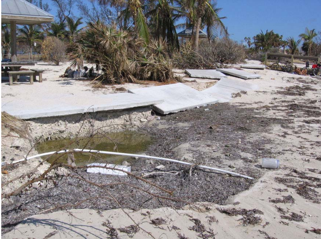
Photo 57. Damage to Rest Beach infrastructure.