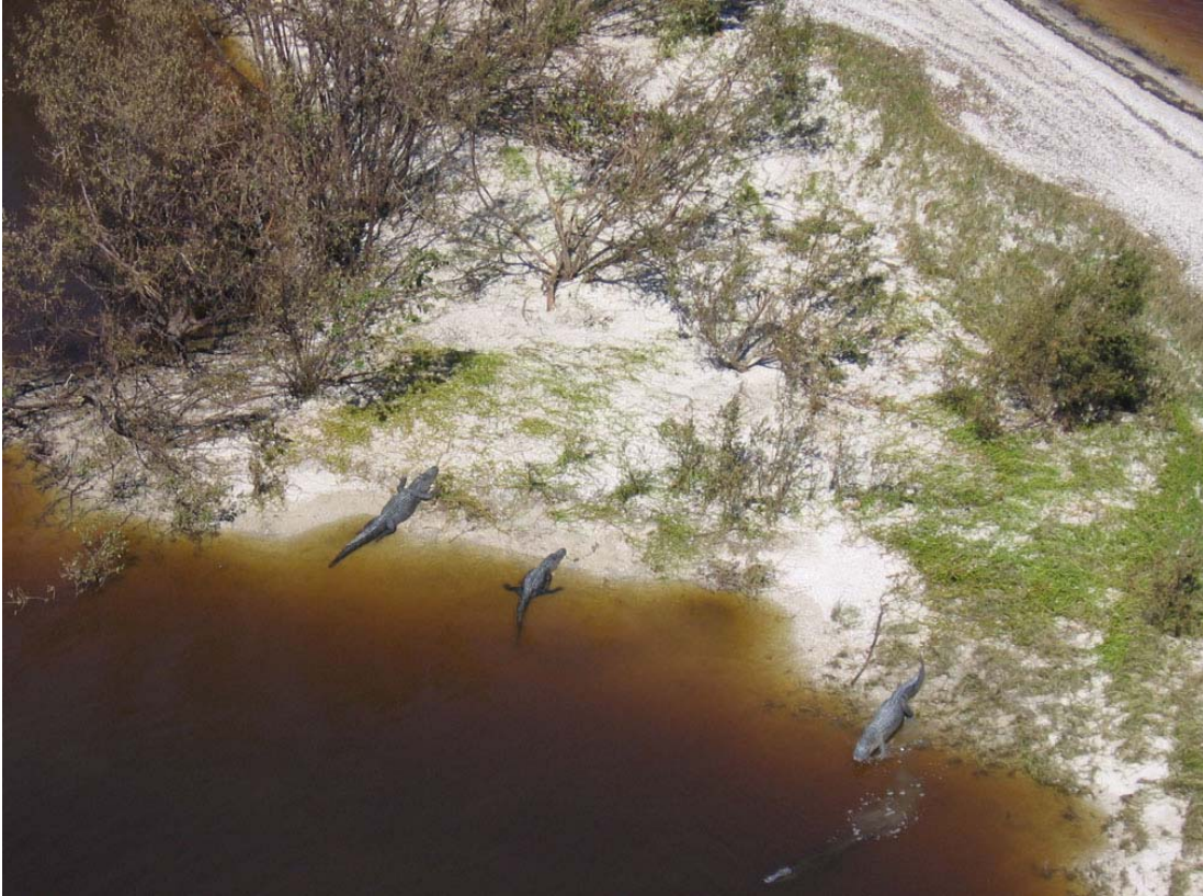
Photo 59. Damaged ecosystem, Everglades National Park.