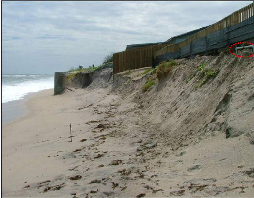
Photo 74. Erosion of dune restoration project by Hurricane Ophelia, Brevard County (R158.5).

Throughout Brevard County, minor beach erosion (condition I) was sustained. One exception was observed in the critically eroded south county area near R158.5. In early September 2005, when Hurricane Ophelia passed 70 miles offshore of Brevard County, there was significant erosion at this location where dune restoration had been conducted following the 2004 storms (Photo 74). Additional moderate beach and dune erosion (condition III) from Hurricane Wilma's offshore passage, has now undermined a swimming pool and threatened a neighboring single-family dwelling (Photo 75).