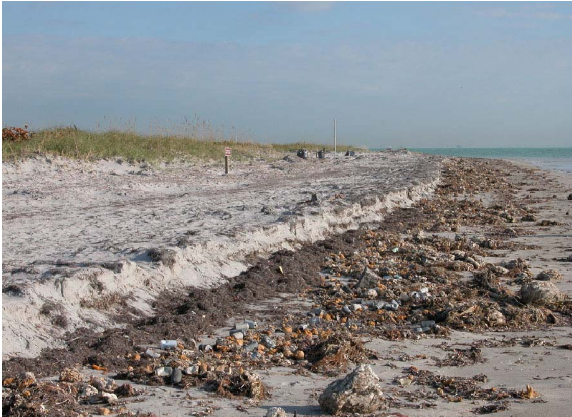
Photo 60. Minor beach erosion at Bill Baggs Cape Florida State Park (R112).