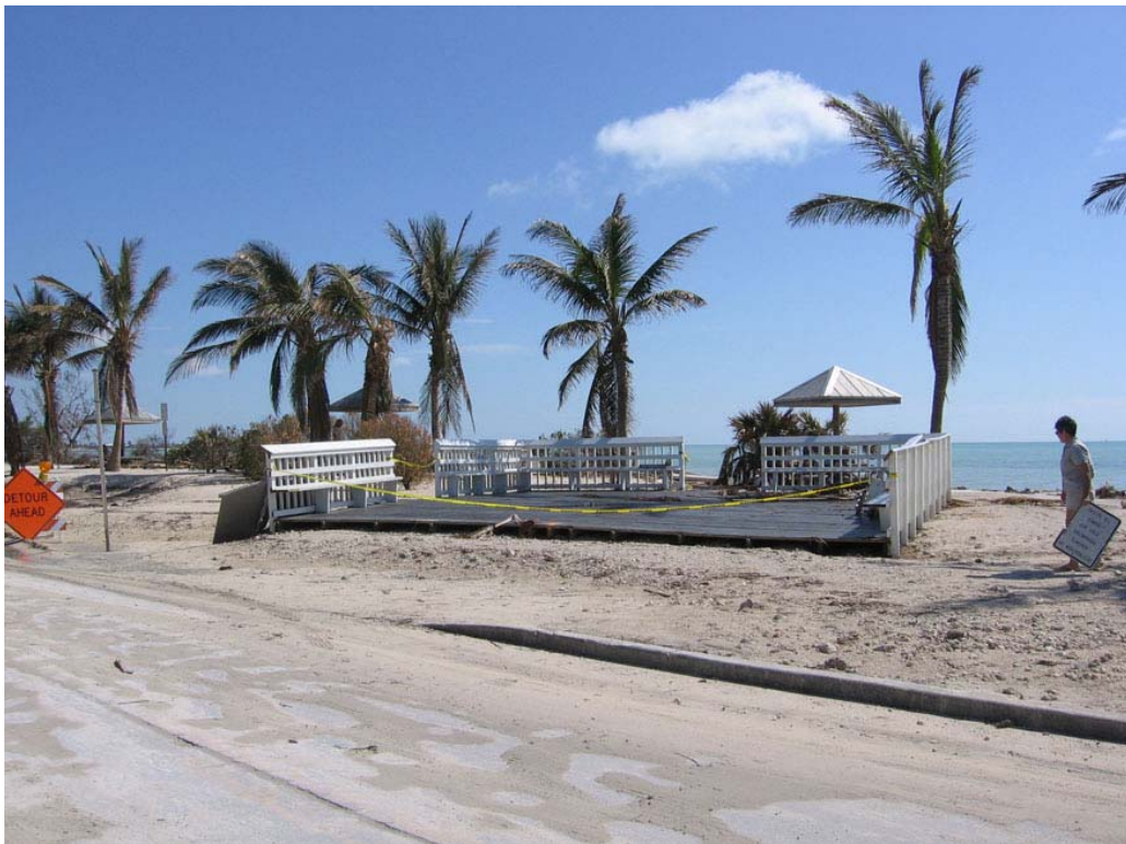
Photo 58. Wilma's storm surge carried the Yoga by the Sea platform from Higgs Beach east to Rest Beach.