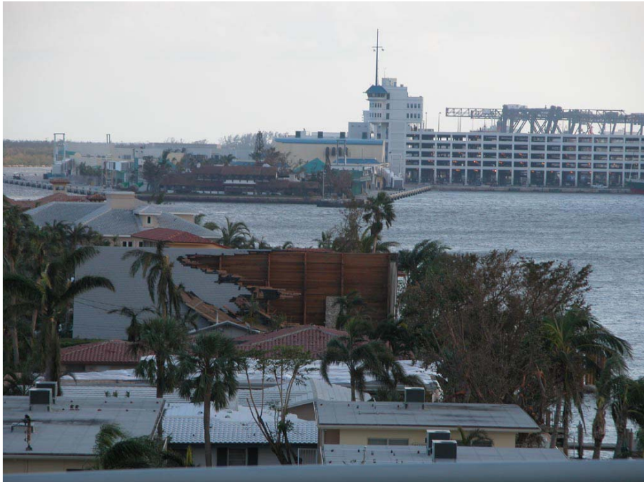
Photo 65. Major roofing damage. Fort Lauderdale.

Atlantic Intracoastal Waterway sustained major roof damage (Photo 65). Many boats, docks, and bulkheads were damaged. Dry storage marinas sustained major damage (Photo 66).