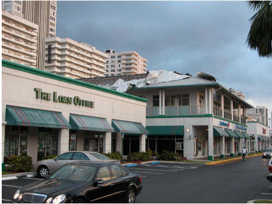
Photo 68. Major roofing damage to commercial building, Ft. Lauderdale (R55.6).

69). Portions of State Road A1A along Pompano Beach and Fort Lauderdale were covered with sand overwash deposits, but were otherwise undamaged.