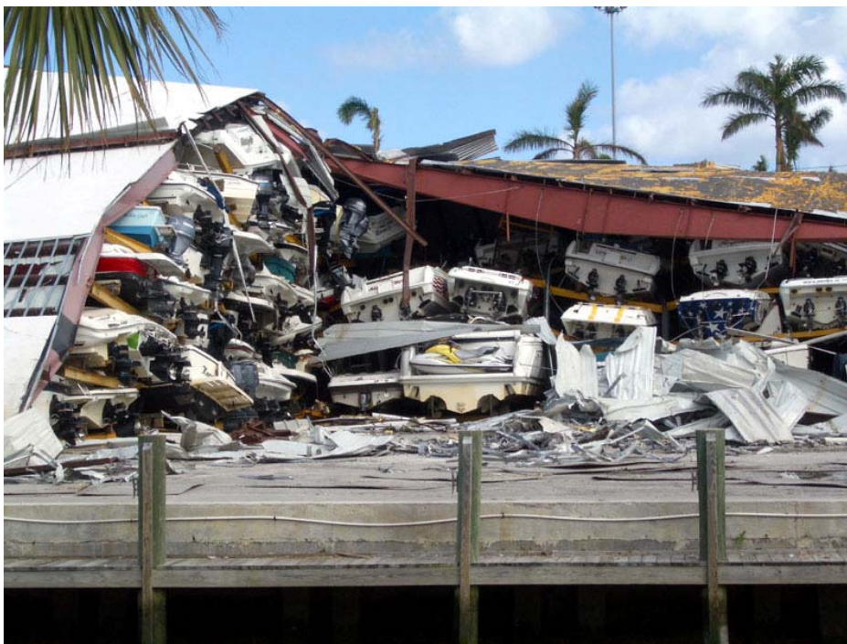
Photo 66. Destroyed dry storage marina (Marina One, Deerfield Beach).