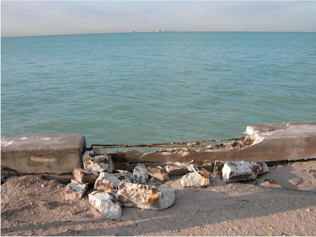
Photo 62. Concrete cap damage, Cape Florida State Park.