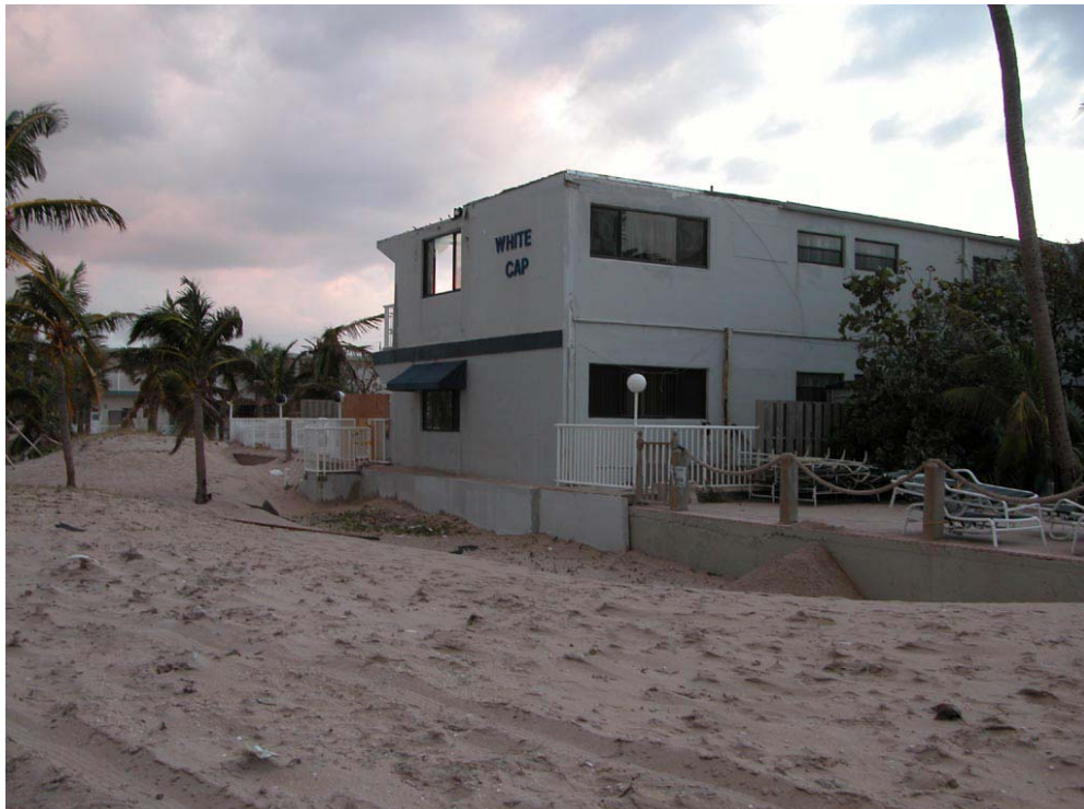
Photo 69. Roof destroyed at beach side hotel, Lauderdale-by-the-Sea (R49.3).