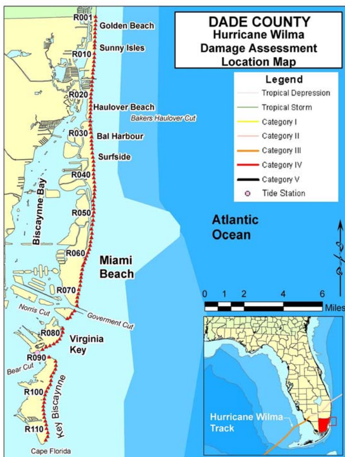
Figure 13. Dade County location map.

The Dade County coast includes 20.8 miles of barrier beaches extending southward from Broward County to Cape Florida at the south tip of Key Biscayne (Figure 13). South of Key Biscayne, the central Dade County coast is a generally open water stretch fronting Biscayne Bay for eight miles between Cape Florida and the Ragged Keys. One small island, Soldier Key, is located in this open water stretch of coast, located roughly five miles south of Cape Florida. The southern 15 miles of the Dade County coast are the northern Florida Keys islands of the Ragged Keys (1.7 miles of five small islands), Sands Key (1.7 miles), Elliot Key (8 miles), Old Rhodes Key (2.6 miles), and Swan Key (0.7 mile). There are four coastal barrier inlets in northern Dade County, including from north to south, Bakers Haulover Inlet, Government Cut, Norris Cut, and Bear Cut. The four major tidal passes in south Dade County are Sands Cut, Caesar Creek, Old Rhodes Channel, and Broad Creek. Dade County includes the following barrier beach communities and major parks: Golden Beach, Sunny Isles, Haulover Beach Park, Bal Harbour, Surfside, Miami Beach, Fisher Island, Virginia Key Beach Park, Crandon Park, Village of Key Biscayne, Bill Baggs Cape Florida State Park, and Biscayne National Monument.