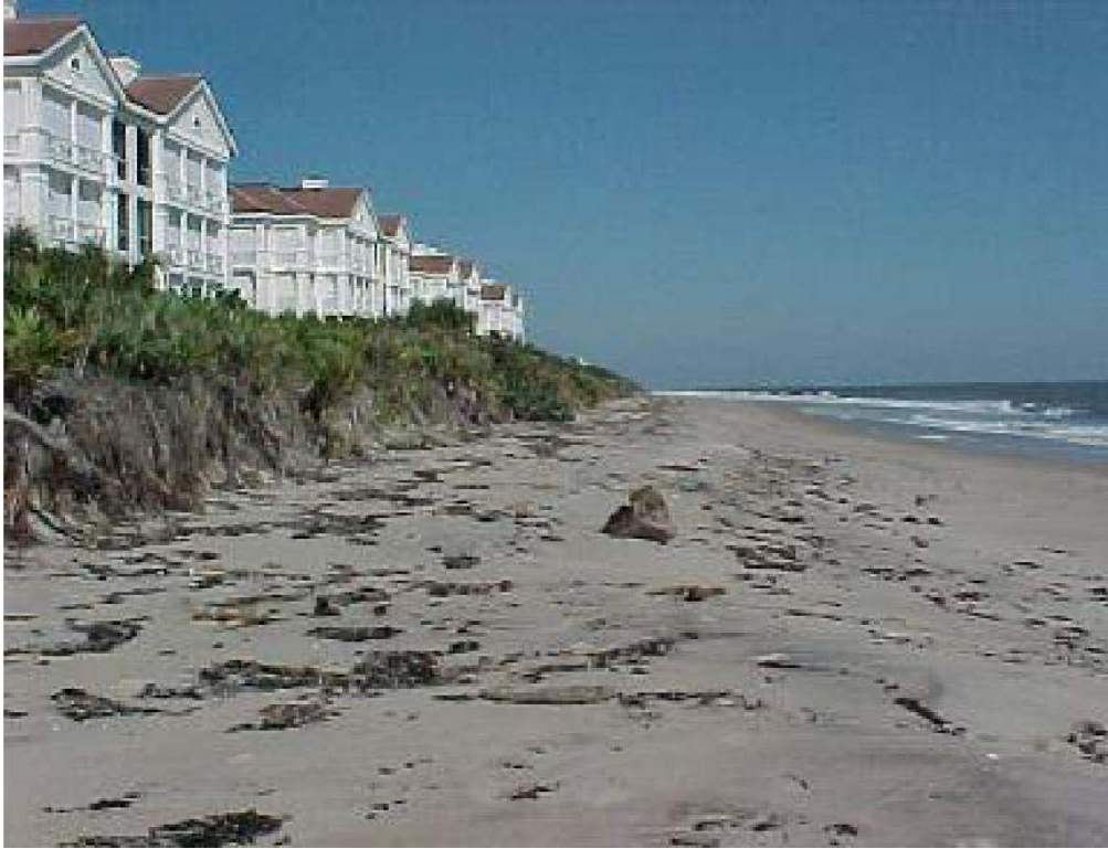
Photo 72. Moderate beach and dune erosion, Indian River County (R51).