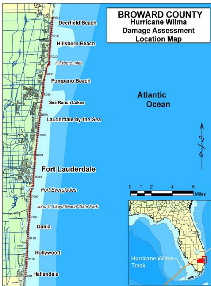
Figure 14. Broward County location map.

Broward County is located on the southeast coast of Florida between Dade County to the south and Palm Beach County to the north (Figure 14). The county has approximately 24 miles of Atlantic Ocean fronting beaches. Barrier dune elevations average about +15 feet and beach-dune sediments are comprised of carbonate and silica sands and shell fragments. The net direction of longshore transport along Broward County's beaches is to the south. There are two coastal inlets in Broward County: Hillsboro Inlet and Port Everglades Entrance. Broward County includes the following beach communities and major parks: Deerfield Beach, Hillsboro Beach, Pompano Beach, Sea Ranch Lakes, Lauderdale-by-the-Sea, Fort Lauderdale, John U. Lloyd Beach State Park, Dania, Hollywood, and Hallandale.