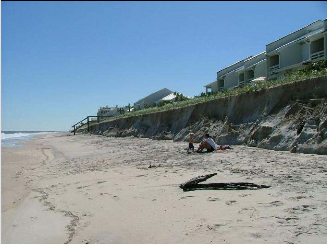
Photo 71. Erosion of dune restoration project, R47.4, Indian River County.

Most of the county sustained minor beach and dune erosion (condition II). No overwash occurred within the county, and the most significant dune recession was observed adjacent to vertical seawalls. The most severe erosion conditions were observed in the Town of Indian River Shores between R46 and R55, where moderate beach and dune erosion (condition III) was sustained (Photos 71 and 72). The critically eroded south county beaches between R101 and R107 sustained minor beach and dune erosion (condition II) (Photo 73).