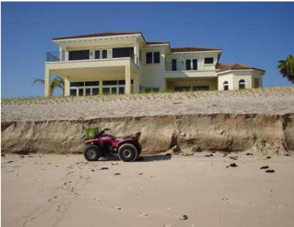
Photo 73. Erosion of dune restoration project, south Vero Beach (R102.5).