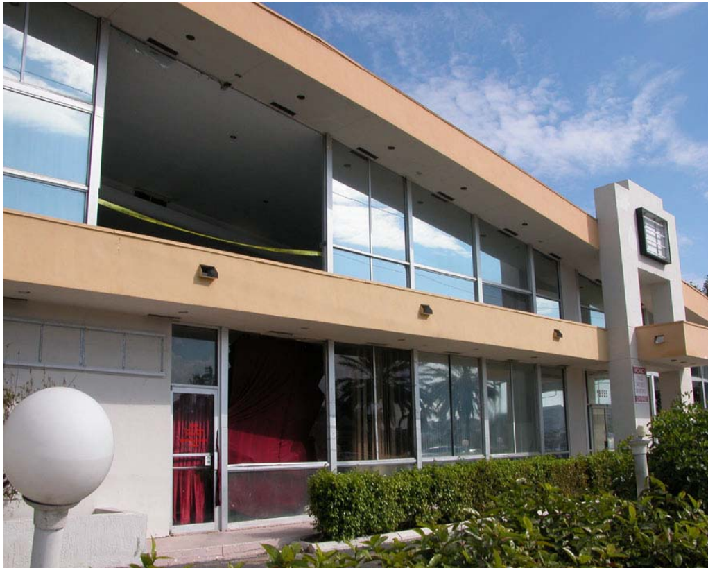
Photo 61. Broken windows, Golden Nugget Motel, Sunny Isles Beach.

On the barrier islands, there was minor to moderate wind damage to ocean front high-rise condominiums, low-rise motels, commercial buildings, and single-family dwellings (Photo 61). The typical wind damages were broken windows, damaged hurricane shutters, and minor roofing losses. No major structural damage was observed seaward of the Broward County Coastal Construction Control Line or within the Coastal Building Zone. The majority of the damage near the coast occurred north of Bakers Haulover Inlet.