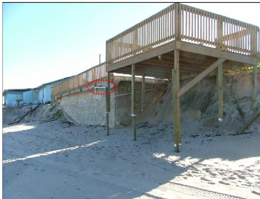
Photo 75. Pool undermined and dwelling threatened by Wilma, Brevard County (R158.5).