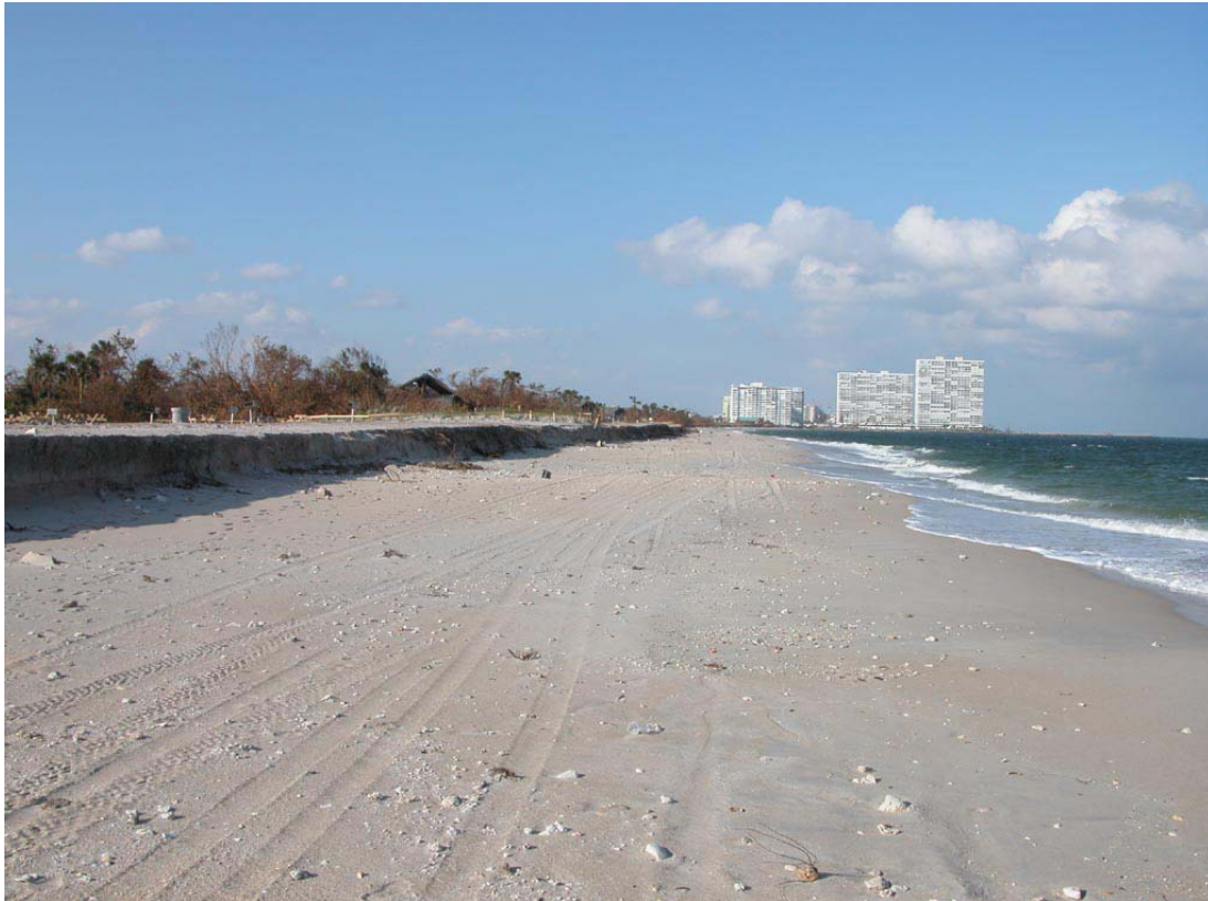
Photo 64. Moderate beach erosion at John U Lloyd State Park (R88).

South of Port Everglades Entrance, conditions within John U. Lloyd State Park (R86-R98) varied between minor beach erosion (condition I) and minor beach and dune erosion (condition II) (Photo 64). Also within the park, small segments of moderate beach and dune erosion (condition III) were sustained near R90 and R96. To the south, Dania, Hollywood, and Hallandale generally sustained minor beach erosion (condition I); however, small segments of beach accretion were observed.